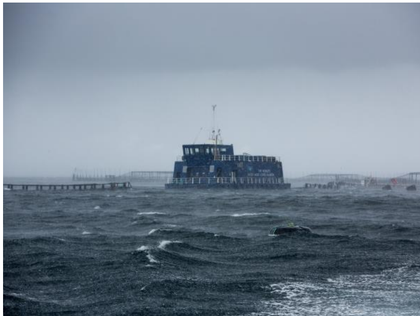
An offshore aquaculture installation.

Carnegie's team will contribute expertise to the projects and help guide the direction of future work. Further information can be found on the BECRC website.