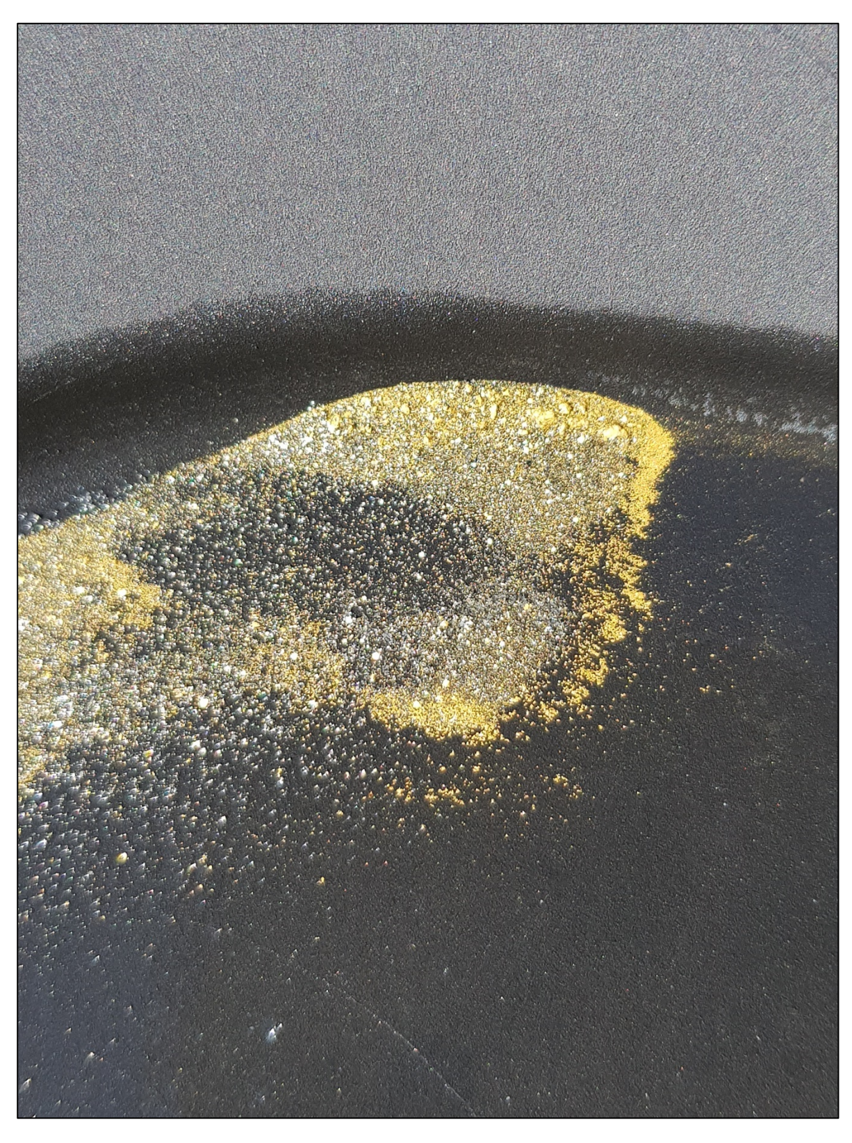
Figure 3 – Panned visible gold from RXRC287 @ 151m