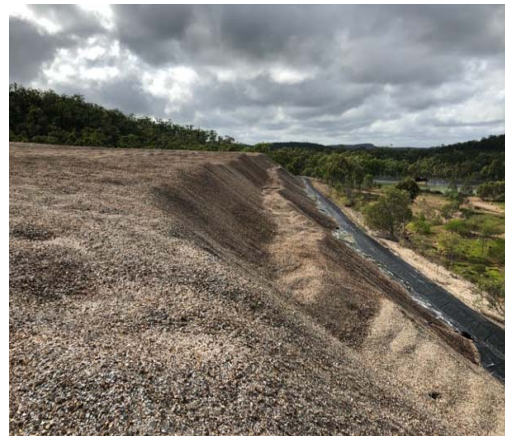
Big Rush Historic Heap Leach Pad