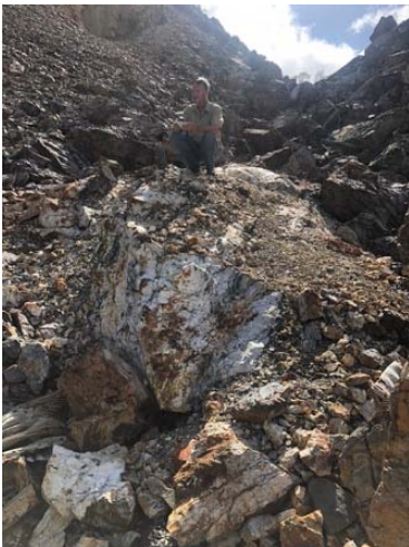
High Grade Quartz Big Rush Central Pit