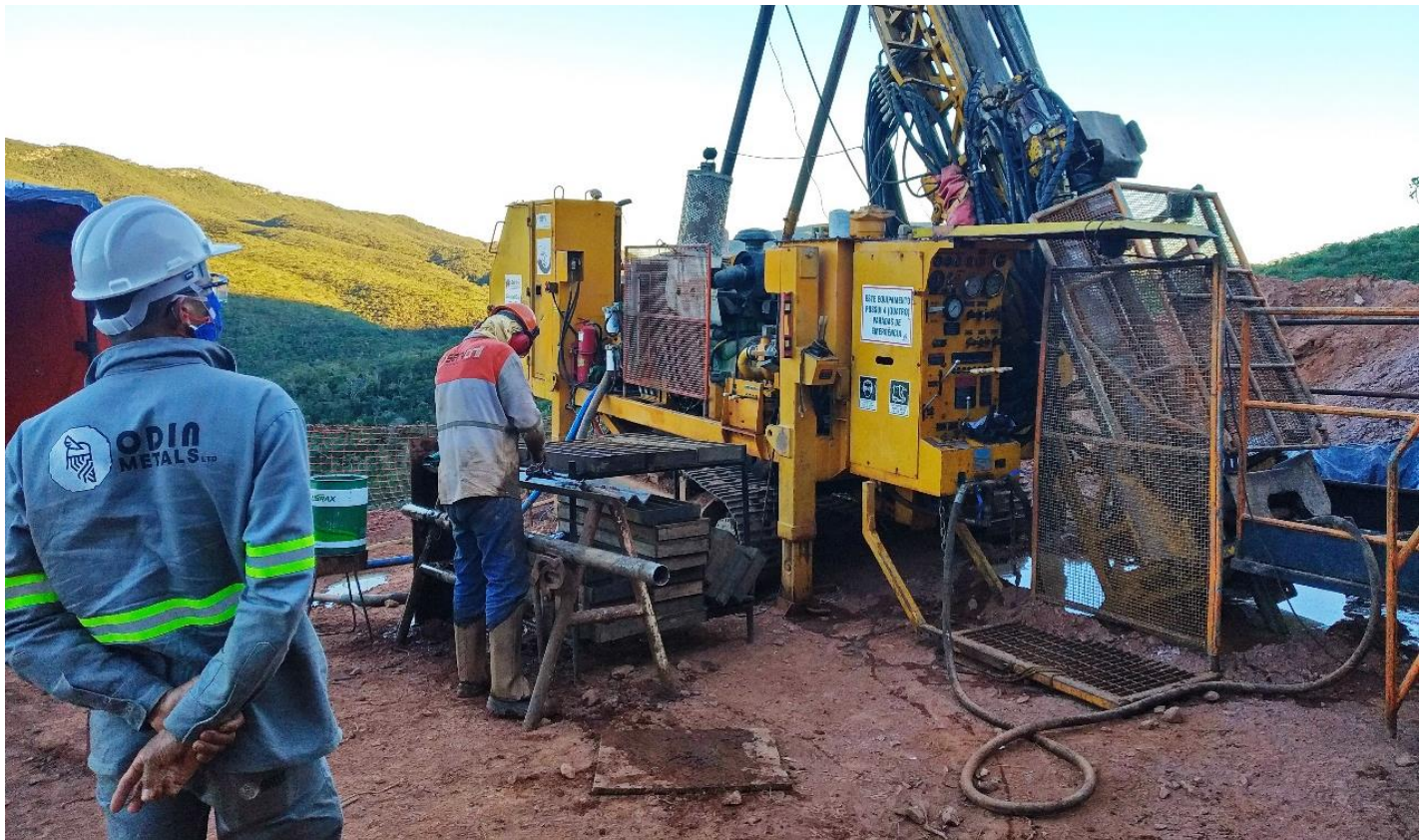
Drilling commenced at Monte Azul, Brazil