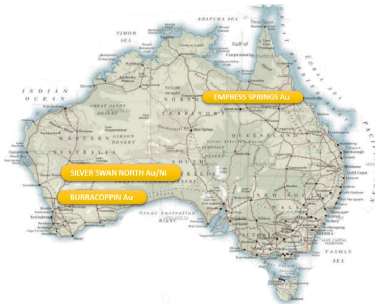
MAP OF MOHO's PROJECT AREAS

Moho Resources Ltd is an Australian mining company which listed on the ASX in November 2018. The Company is focused on gold and nickel exploration at Empress Springs, Silver Swan North and Burracoppin.