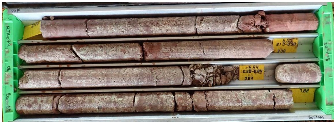
Figure 3: Fresh volcanoclastic kimberlite material (at 3m depth) in drill core from L072

The drill rig has already relocated to the nearby L072 kimberlite where delineation drilling has commenced and VK material has been intersected in the first hole drilled (Figure 3).