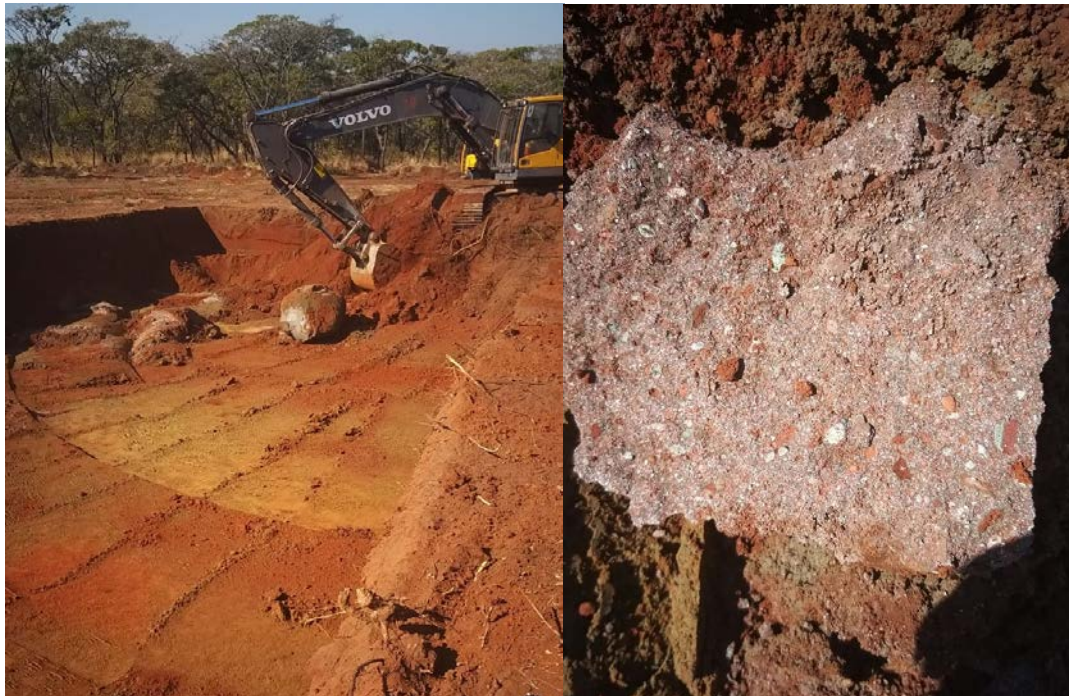
Figure 1: Kimberlite bulk sampling excavation activities underway at the first selected L071 sample site (left) and excavated volcanoclastic kimberlite (right)

Excavation of the ~2,000 tonne bulk sample has commenced at the first selected site (Figure 1), following which the VK material will be transported to the Lulo processing plant.