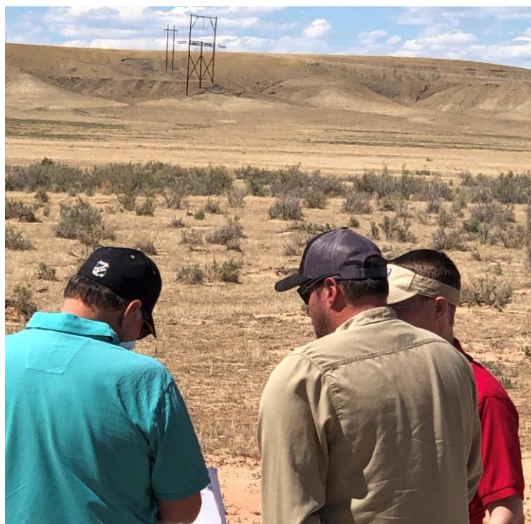
Figure 1: Anson CEO discusses power supply options for NaBr production plant

Anson Resources Limited (Anson or the Company) has made further progress in the development of its planned Bromine/Lithium plant with the completion of land and cultural studies and spring environmental studies over its Paradox Brine Project claims in Utah, USA (Paradox Brine Project or Project). In addition, Anson has appointed the local supplier of electricity to commence an engineering study for the supply of power to the proposed production plant. Anson remains focused on the Paradox Brine Project and is moving forward with its development.