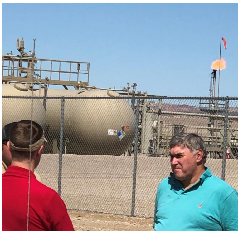
Figure 2: Flaring of gas at a nearby gas plant

“The progress that has been made with the land and cultural surveys at the proposed site of the production plant is also very pleasing as was the completion of the spring environmental surveys over the claims included in the Project. Despite the PEA only recently being completed, Anson was able to quickly mobilise its consultants to conduct the required survey.”