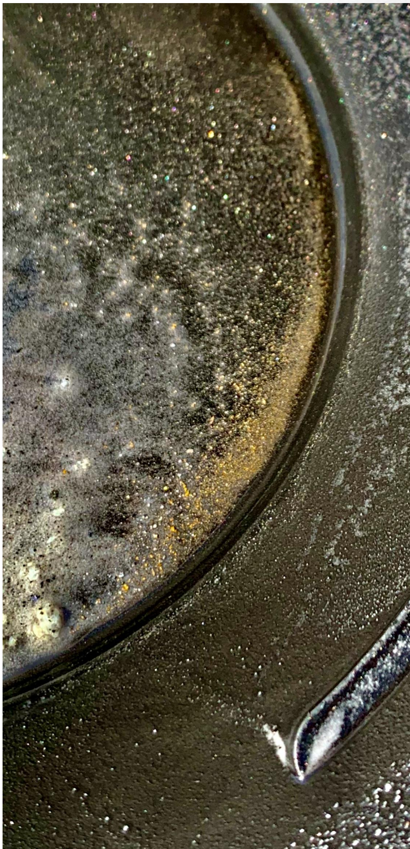
Figure 2: Visible gold in panning dish from hole FKGRC184 at 82-83m grading 304 g/t Au.