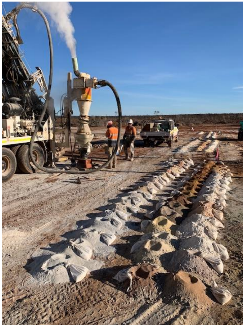
Figure 3: JUNE 2020 Drilling – Kat Gap