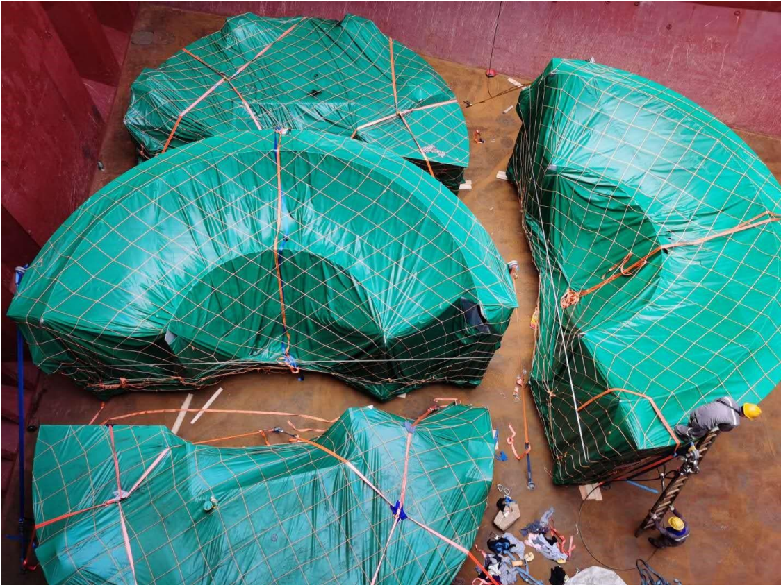
Figure 3: Crystalliser components in ship hold