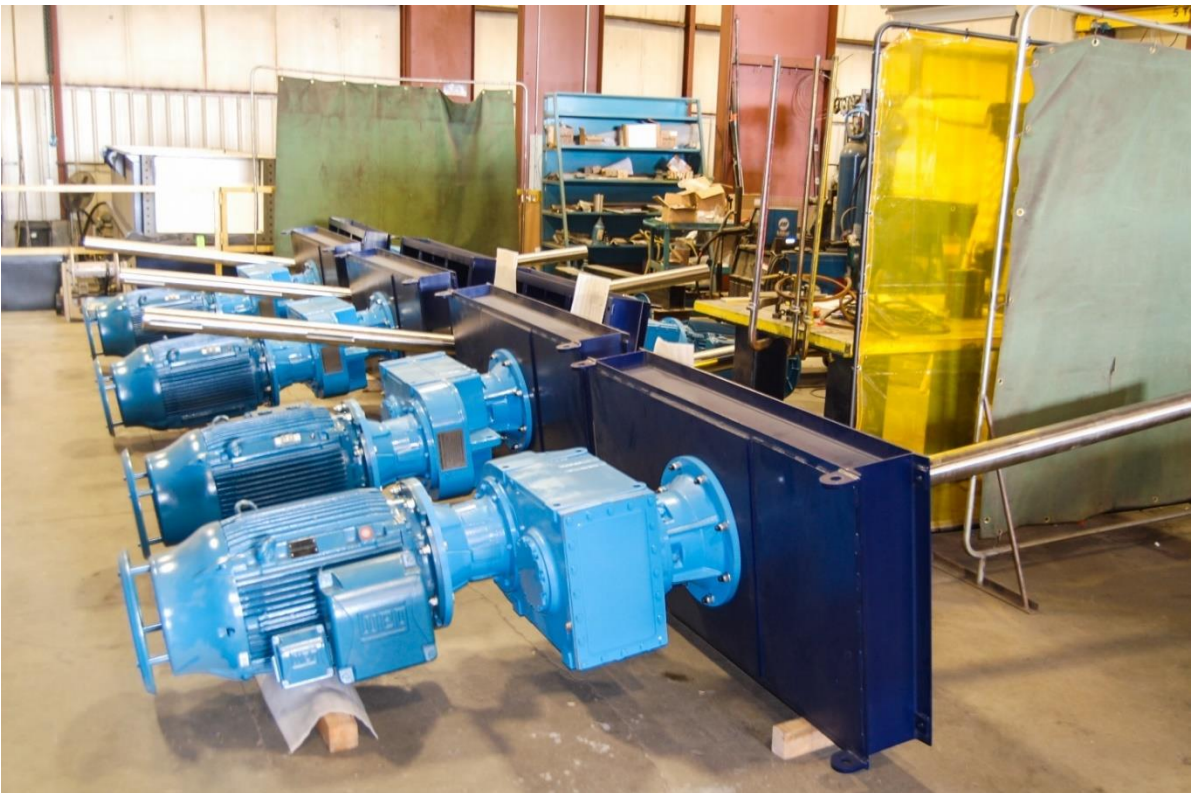
Figure 5: Drive assemblies for the Attritioner Cell being assembled in Puslinch, Ontario, Canada