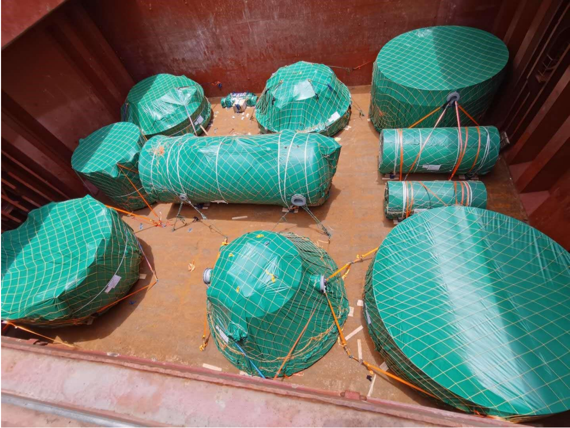
Figure 2: Crystalliser components in ship hold