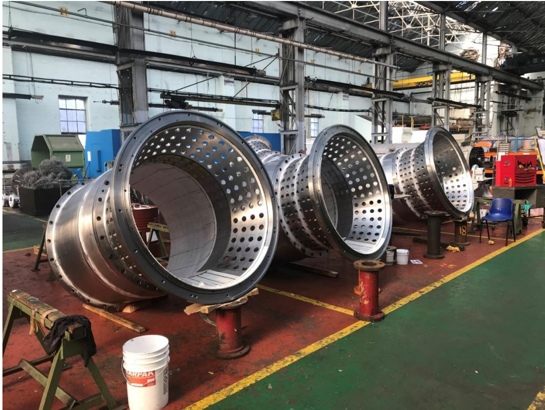
Figure 6: Centrifuges in Huddersfield, Yorkshire, United Kingdom