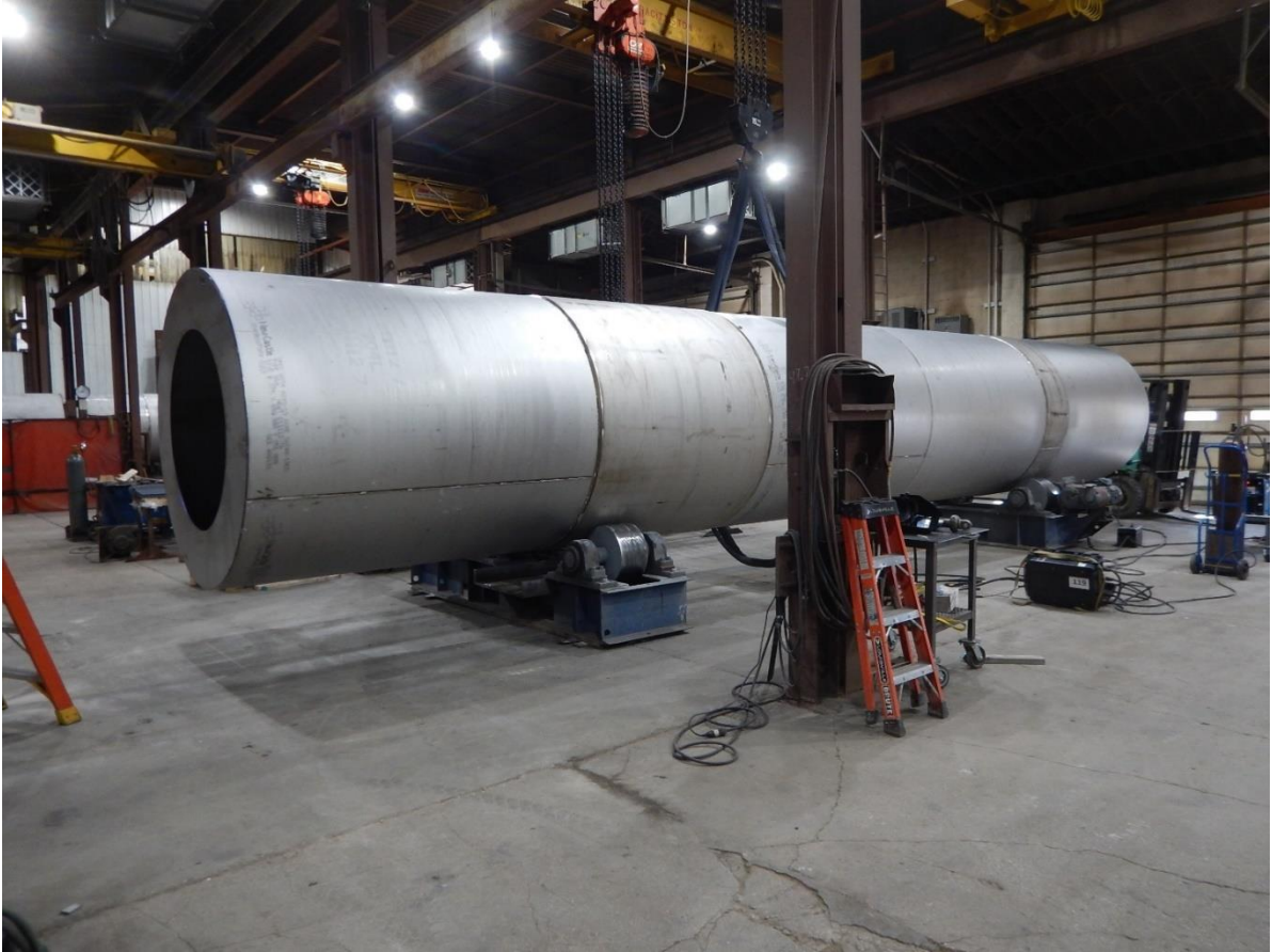
Figure 4: Rotary dryer on factory floor in Green Bay, Wisconsin, USA