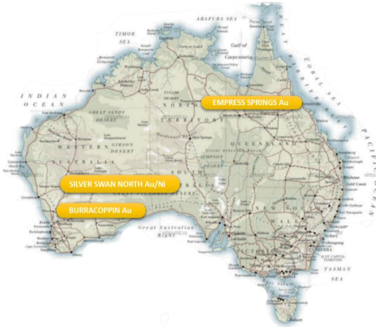
MAP OF MOHO'S PROJECT AREAS

Moho Resources Ltd is an Australian mining company which listed on the ASX in November 2018. The Company is focused on gold and nickel exploration at Empress Springs, Silver Swan North and Burracoppin.