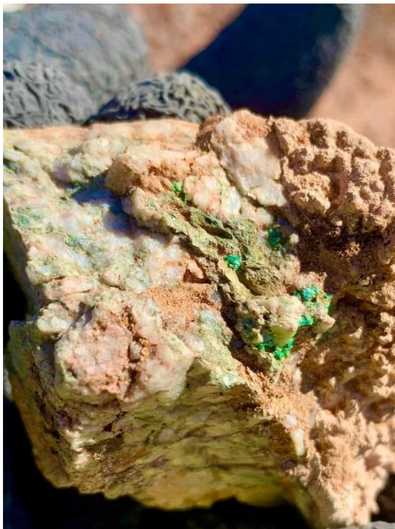
Figure 2: Photograph of Malachite Located 1km South of Sampling at Woolshed Adjacent to the High Magnetic Anomaly (Sample No WK0497 - results pending)

Anomalous gold and silver was reported from Woolshed with a best result of 29.3g/t Ag from sample WK347. Light rare earths (LREE), which are known to be IOCG pathfinders, up to 505ppm were also reported at Woolshed. Best copper grades were reported from carbonate and altered breccias ( up to 17.6% Cu ) while mineralised intruded dolerites reported up to 1.74% Cu suggesting simultaneous movement of the volcanic intrusions and mineralised fluids along the Mt Stephen Thrust.