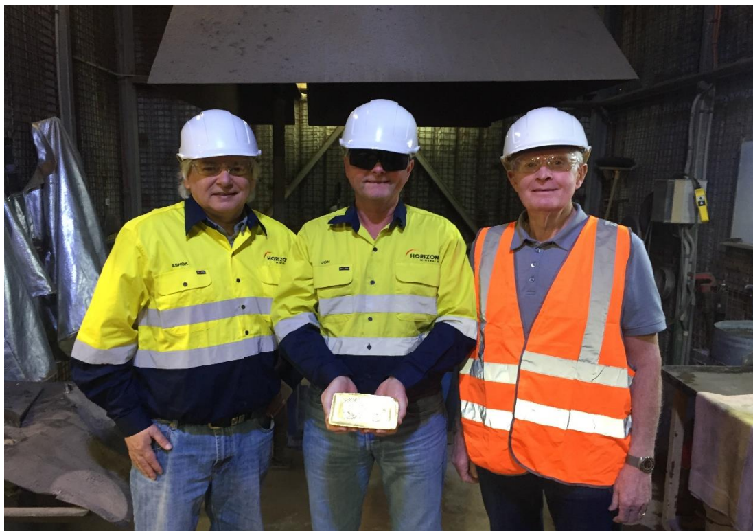
Figure 1: The Horizon Board with the first gold from the Boorara gold mine