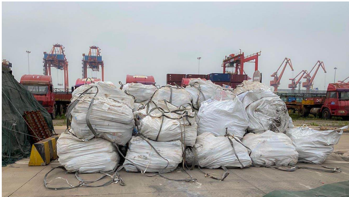
Bulk material from the Maniry Project in Madagascar