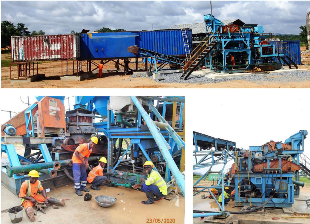
Figure 4: The 5 tph bulk sample plant has been relocated from its position adjacent to Tongo Dyke-1, to the main plant site adjacent to the main camp in readiness to process bulk samples from Peyima and other Resource expansion programmes, and the first tonnes from underground at Kundu. The erection of the 100 tph plant has been delayed because of manufacturing delays in South Africa brought about by the Covid-10 pandemic, so the 5 tph bulk sample plant will be used to process the first production tonnes before the end of this year. The 5 tph plant comprises a primary crusher (not in picture), secondary crushers, dense media separation, and a dual Flowsort X-ray diamond recovery system.

To mitigate the delay in construction and commissioning of the 100 tph plant during 2020, the 5 tph bulk sample plant was relocated from its previous location adjacent to the Tongo Dyke-1 kimberlite, some 11 km to the main plant area adjacent to the camp, to support the overall project objective of achieving first diamond production by year's end (Figure 4). This plant has sufficient capacity to process the first ore deliveries as stopes are gradually added to the production capacity.