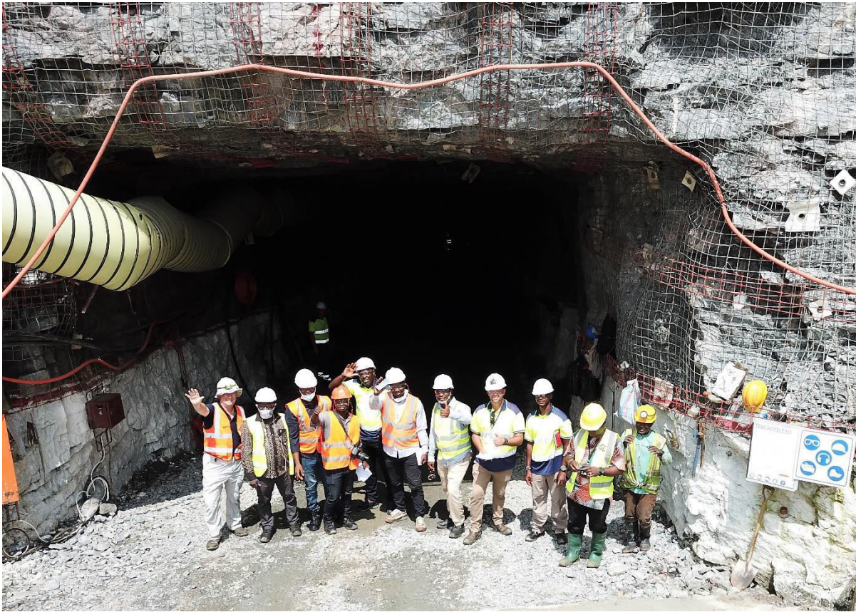
Figure 6. The Company hosted the EPA for the annual environmental audit during June