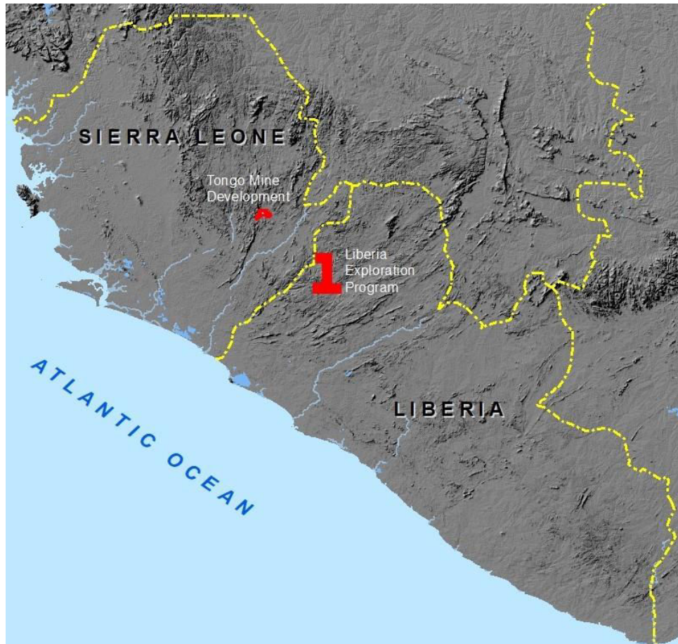
Figure 8. Location of the Company's licences in Liberia and Sierra Leone.

Exploration work on the Kumbgo Kimberlite Project focussed on second phase reconnaissance and follow up stream sampling within the more interesting western part of the licence where the probable southern extensions of the known Kumbgo kimberlites dykes extend. Laboratory results previously confirmed many positive samples with probe confirmed kimberlitic ilmenite. A total of 42 stream samples were collected in April and were consigned to The MSA Group laboratory in South Africa.