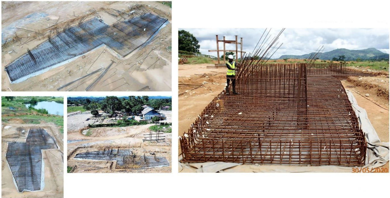
Figure 3. The foundation for the 100 tonne per hour (tph) made good progress during the quarter and is 80% complete.

Although the manufacture of the 100 tph plant has been temporarily suspended due to the Covid-19 related lockdown in South Africa, preparation of the earthworks on site continued. The filling and compacting at the ROM Tip wall area was completed, and the rest of the main plant foundations was 80% completed during the quarter. In addition, the steelwork for the wall reinforcement and service tunnel commenced.