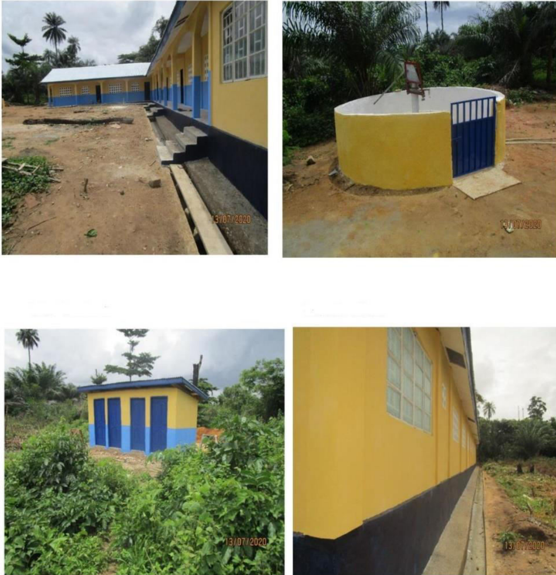
Figure 7. Progress at the school at Lowoma Village within the Tonguma Mining Licence. Top left, the front of the school after painting; top right, and hand pump well for clean, fresh water; bottom left, toilet facilities; bottom right, the rear of the main school building. Education is one of the key pillars of the community development programme identified jointly by the Company and community.

The three building contractors appointed to construct schools in the Project area all made good progress during the Quarter. Pictures of the school at Lowoma village are shown in Figure 7. Until the mine is in production (and a royalty-based community contribution is initiated), the Company is committing U$100,000 per annum into community projects which are selected and overseen by the community themselves, as well as the District Council and Civil Society.