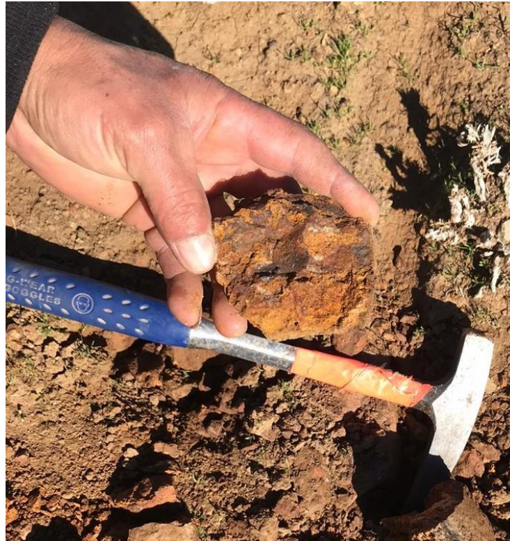
Figure 3: Colina2 Surface sample showing goethite-limonite alteration

Additionally, two trenches tested the NE-SW orientated copper in soil anomaly with a coincident IP anomaly. Targeted RC Drilling will follow subject to the success of the above exploration work, and if successful will move quickly to a substantial drill out campaign for the remainder of the year.