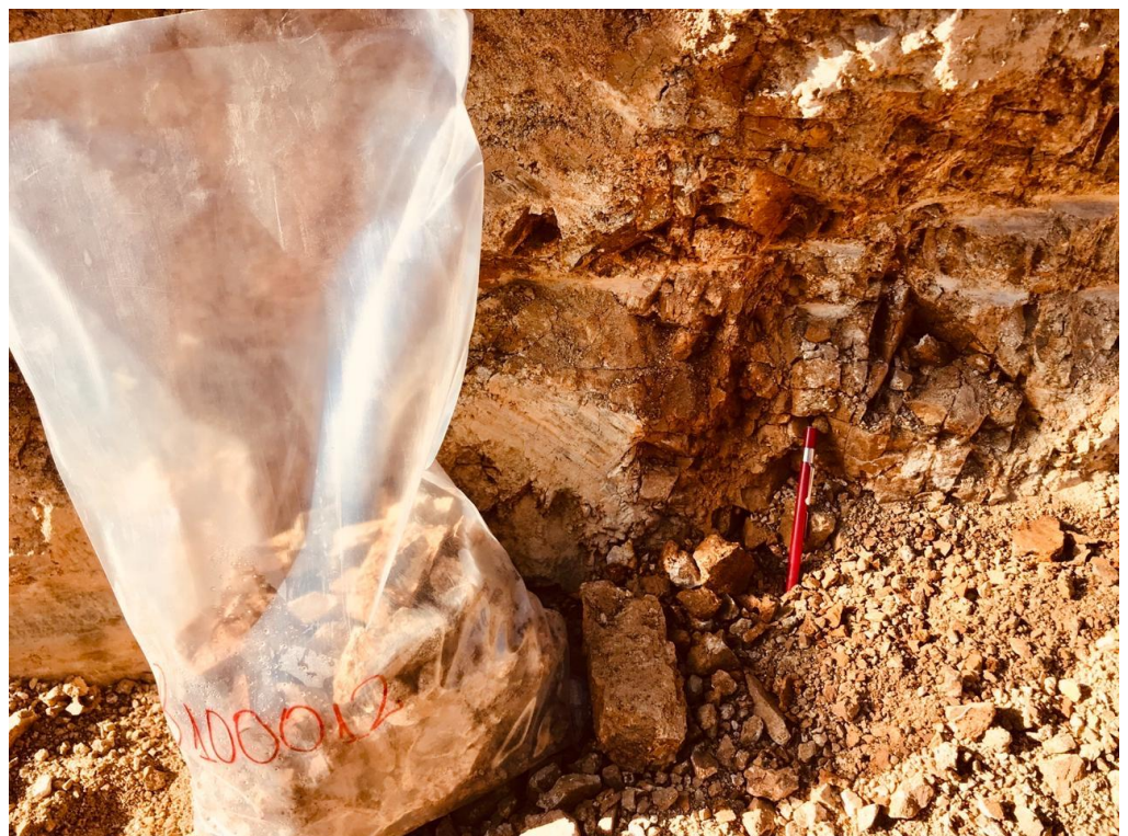
Figure 1: Trench view at Colina2 Gold Copper Project

Trenching has been completed to identify the source of the significant gold in soil anomaly (see Figure 1). Approximately 340m was completed with the excavator and sampled on a metre basis. Results are expected to be available within 3-4 weeks. The host rock is an altered grano-diortite intrusive with boxwork textures with hematite-limonite possibly replacing sulfides and magnetite. Some quartz veinlets smaller than 1 mm with a central suture and hematite halo were also observed.