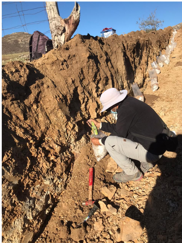
Figure 2: Colina2 Trench Sampling

The response ratio is calculated by averaging the lowest quartile of results to calculate the background value then the sample values are divided by the background value to calculate the response ratio. The MMI anomaly is additionally supported by a traditional Au in soil anomaly coincident with the MMI anomaly with a peak value of 0.3g/t gold.