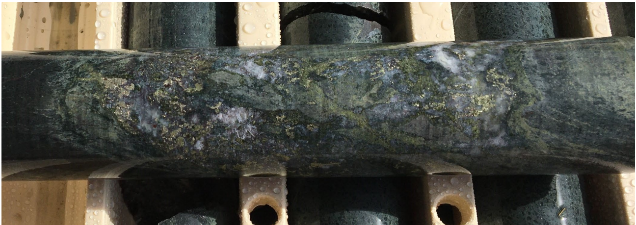
Figure 1. The best intersection of visual chalcopyrite observed in core from the mineralised zone (423m to 438m)

Alice Queen commenced its maiden drillin program at its Boda East Project in late July (ASX Announcment 27 th July 2020). The Company is pleased to report that the first hole has been completed with a visual mineralised zone intersected, confirming that the Boda host rocks extend into the Company's tenement. Alice Queen has received approval to increase its current program by up to 14 holes across this exciting 13km noth-south trend. Preparation for the second drillhole is now underway.