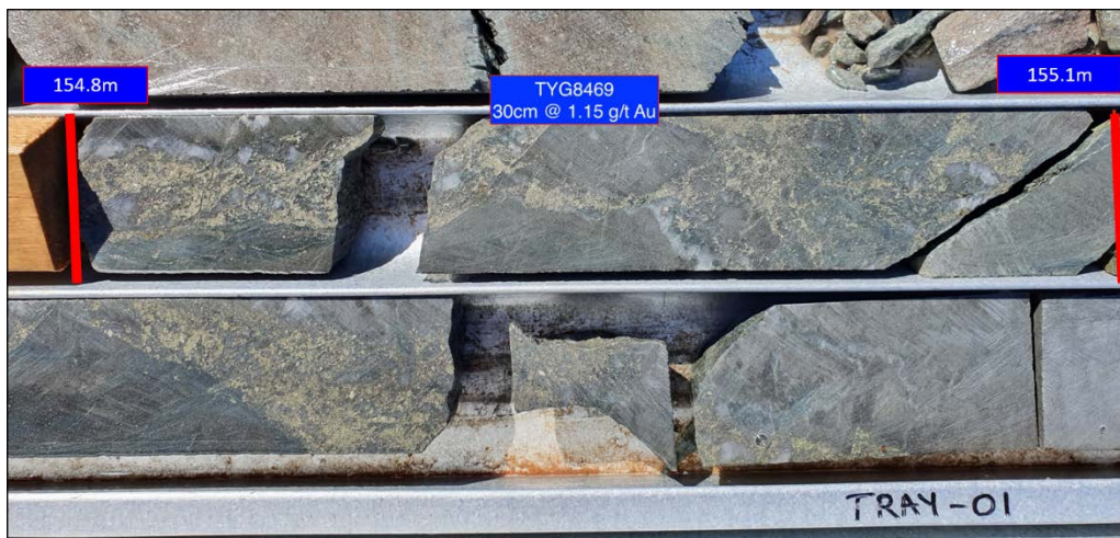
Figure 1: photograph of silicified quartz and sulphide filled quartz breccia hosting gold mineralisation in diamond core from TED05. The particular intersection of focus graded 1.15g/t over 30cm from 154.8m downhole (true depth in vertical bore hole).