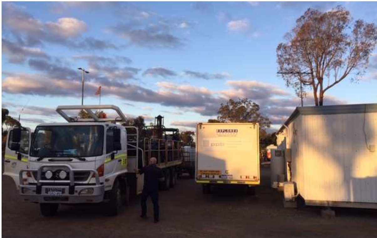
Figure 1: Field crew mobilising to site.