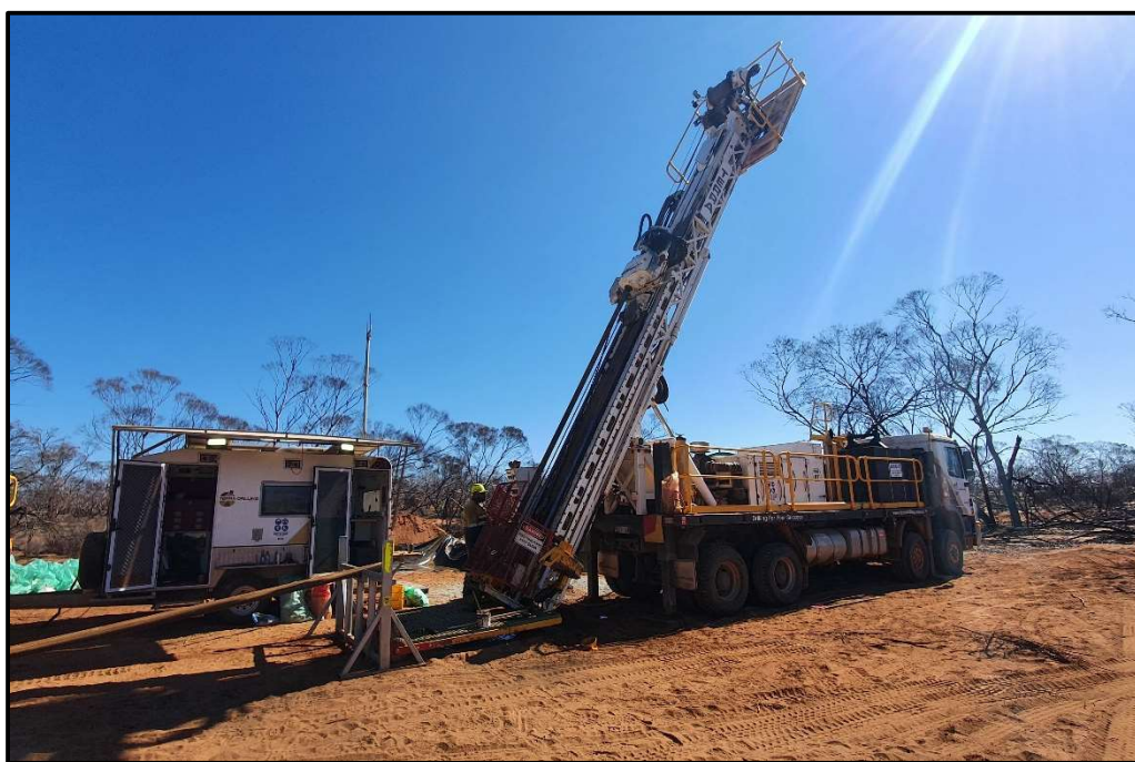
Figure 1 – Diamond Drilling at Galileo's Lantern Prospect in the Fraser Range

Three significant nickel targets will be drilled including an electromagnetic conductor at the Lantern East prospect (Hole 1), a structural target on the margin of a major intrusion (Hole 2), and a disseminated sulphide target at the Lantern South prospect (Hole 3).