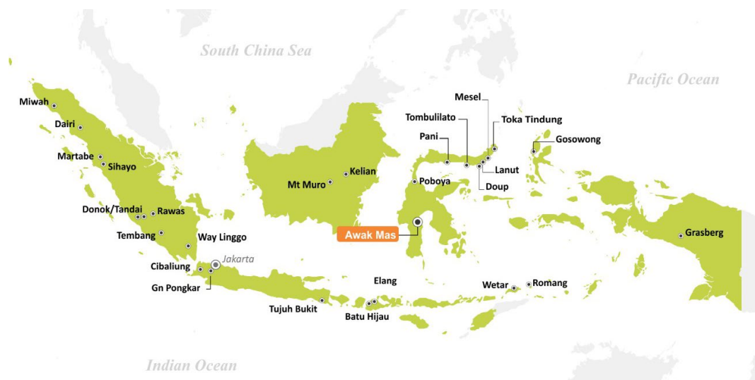
Figure 1: Awak Mas Gold Project Location in South Sulawesi, Indonesia

The Awak Mas Gold Project is located in an established gold province.