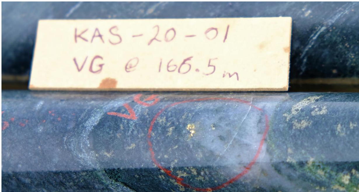
Figure 1 – Visible Gold logged in drillhole KAS20-001

"This intersection of a wide mineralised zone early in our programme, almost exactly where we predicted it should be, confirms our modelling and drill strategy. It is the first time that coarse, visible gold has been noted at Kasagiminnis. We have a highly experienced drill and support crew here and we are all really excited about this first hit and the potential for mineralisation to improve at depth, as seen elsewhere in other Gold mines and Deposits in the Region."