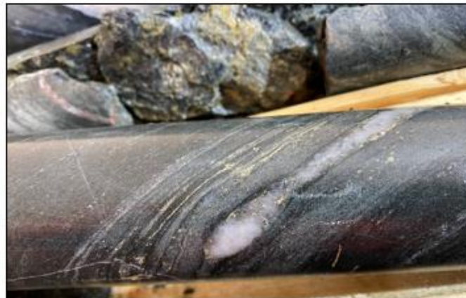
Pyrite + Pyrrhotite associated with quartz veining