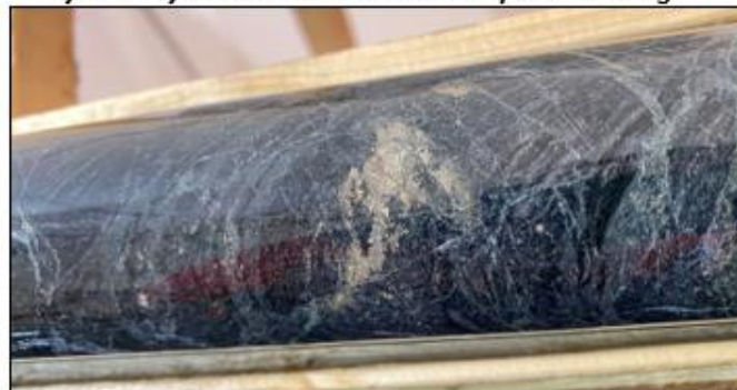
Semi-massive sulphides - Pyrite + Pyrrhotite