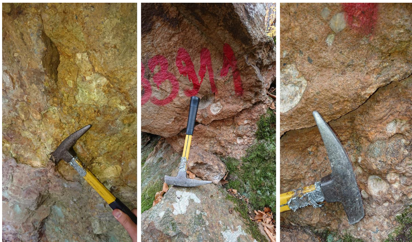
Figure 2 – The low sulphidation gold system is defined by alteration within the overlying sedimentary (sandstone and conglomerate units), which rest on metamorphic basement. This geological setting and style of mineralisation is very similar to the setting of the Ada Tepe gold deposit (Dundee Precious Metals), located approximately 35km to the east