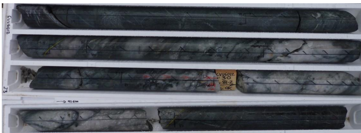
Figure 2 Quartz veining in drill hole CVUG012 from 79.7 to 82m downhole. Assays pending.

This announcement has been authorised and approved for release by the Board of Orminex.