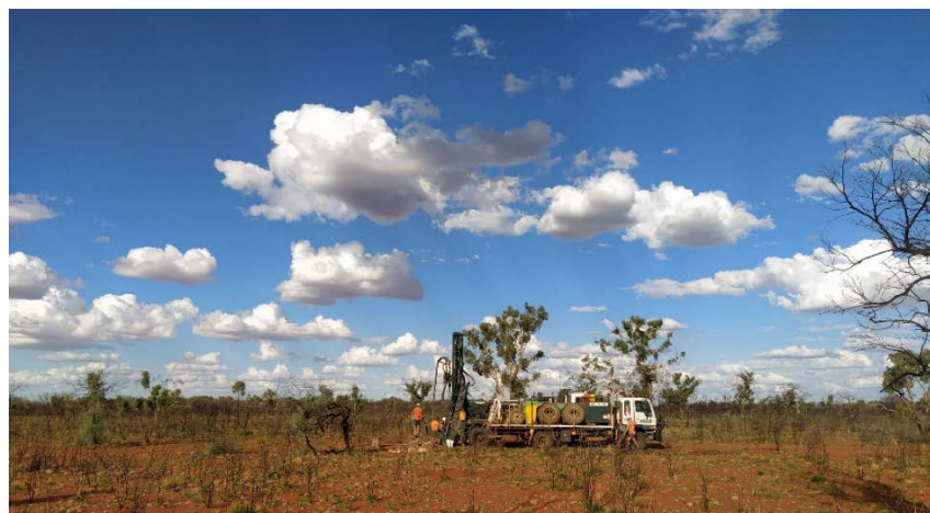
Figure 1 - Aircore drilling during the 2020 North Arunta and Tanami drilling campaign

The campaign comprised 195 aircore holes which were designed to test seven targets across three prospects. The drilling of these high priority targets forms part of Prodigy Gold's broader exploration strategy aimed at systematically exploring the Company's 100%-owned project portfolio to screen for new large-scale gold deposits in the Northern Territory.