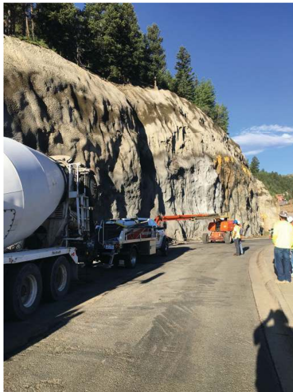
Figure 4. Road-cut stability