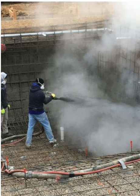
Figure1 Shotcrete trial without added EdenCrete®