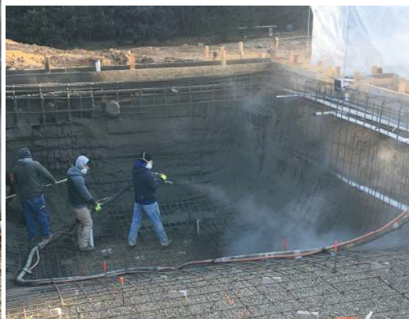
Figure 2 Shotcrete trial with added EdenCrete®

These benefits have translated into significant growth in usage of EdenCrete® in shotcrete applications which now include: