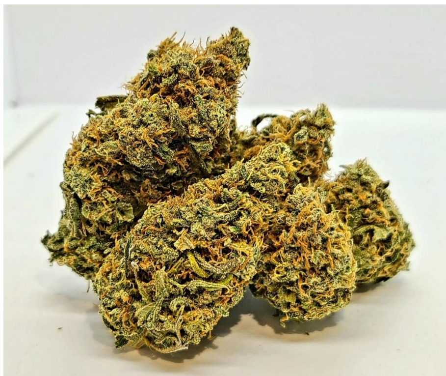
Figure 2: Ritual Green Lemon Haze