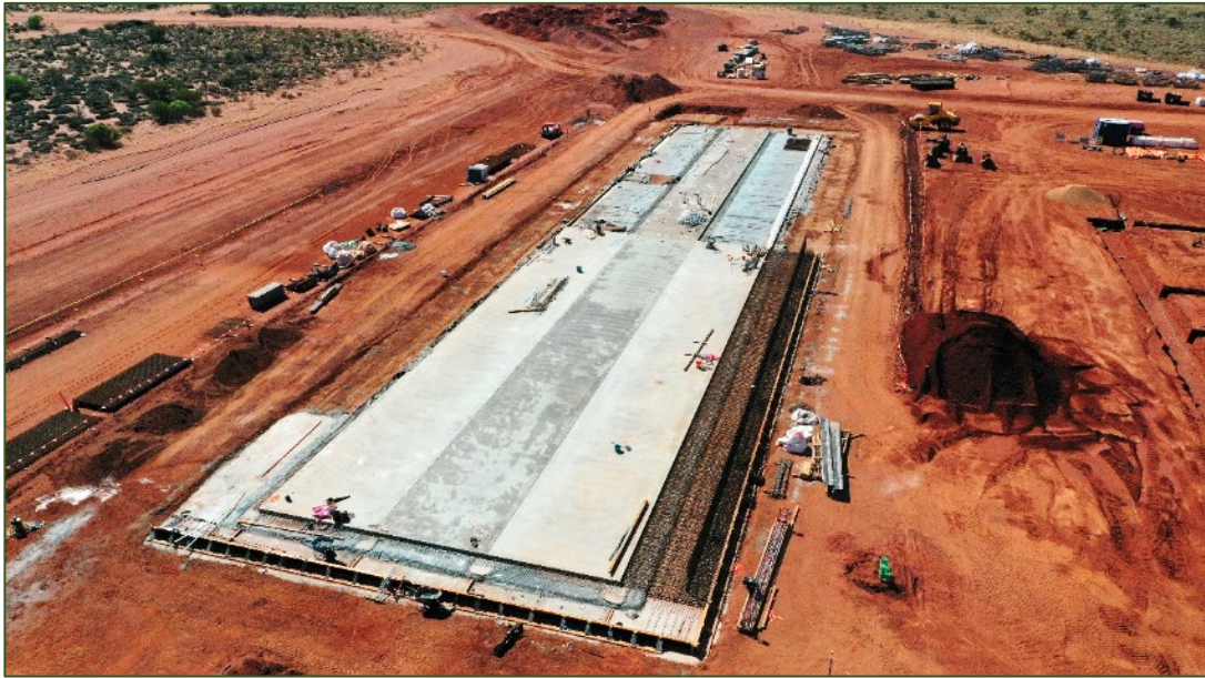
Civil and concrete works in progress for the SOP storage facility