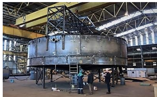
Thickener Trial Assembly