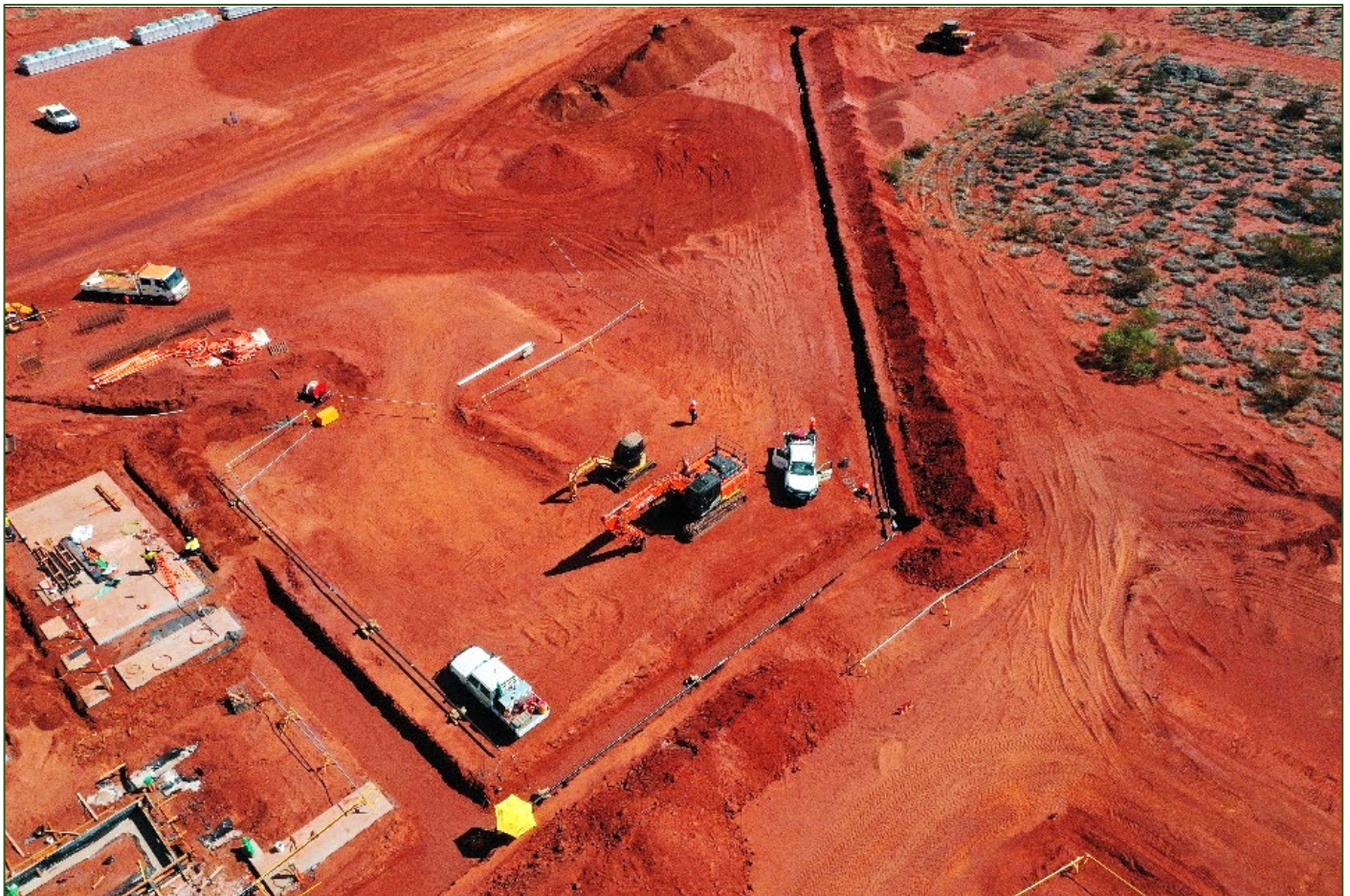
Low pressure gas piping between power station and gas pipeline delivery station

Installation of low-pressure gas piping has also commenced, which will supply gas from the high-pressure gas delivery station to the power station and other areas within the SOP plant.