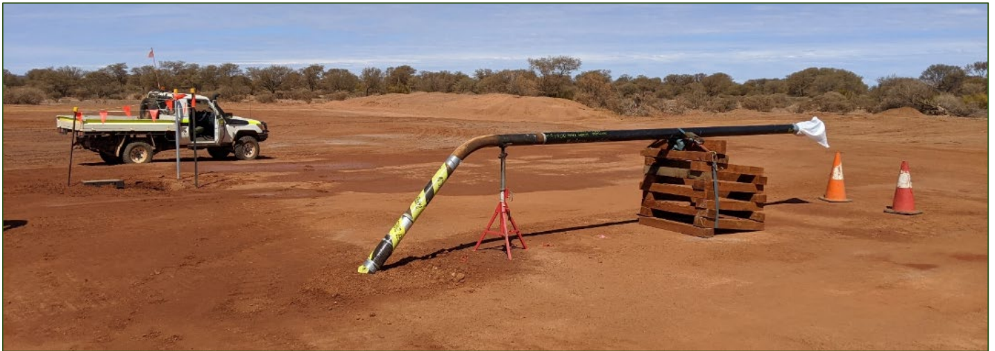
Gas pipeline at inlet station location

Progress on the gas pipeline continues to meet expectations and overall pipeline construction is now more than 70% complete.