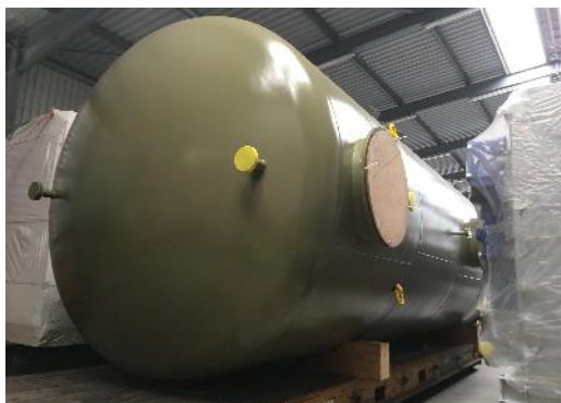
Cooling Crystalliser (component)