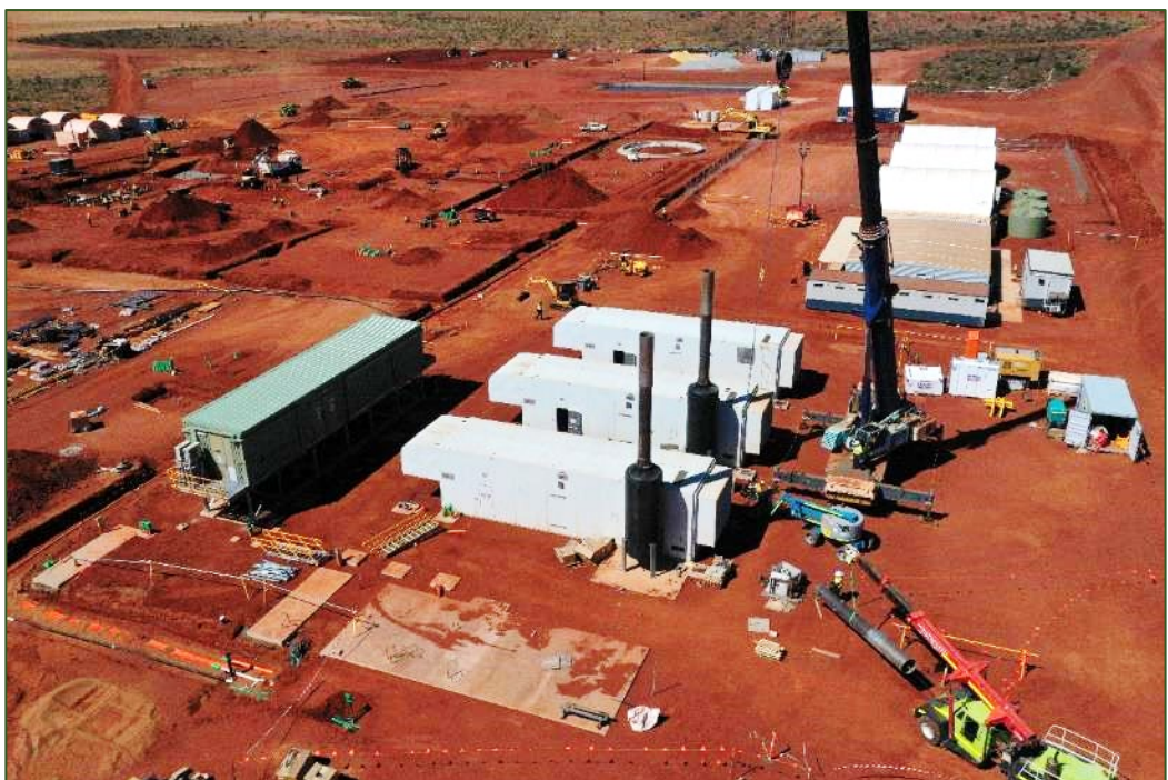
Installation of exhaust stacks