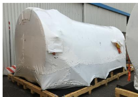
Centrifuges (sealed for transport)

Please follow Kalium Lakes on LinkedIn or visit the website for regular non-market sensitive Project progress updates.