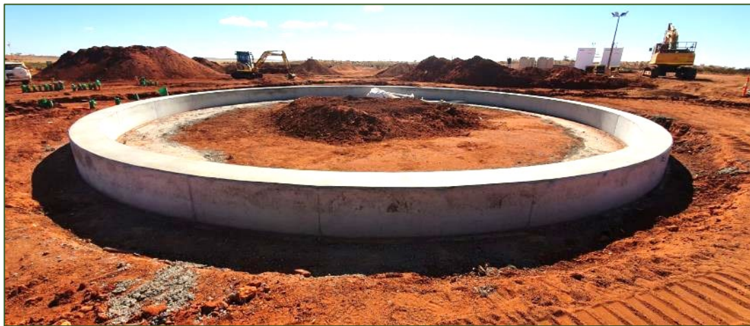
Ring-beam for raw and fire water tank

Delivery of key equipment for the SOP plant also remains on schedule with two shipments delivered to Fremantle, five ships in transit and four shipments due to depart before the end of October 2020.