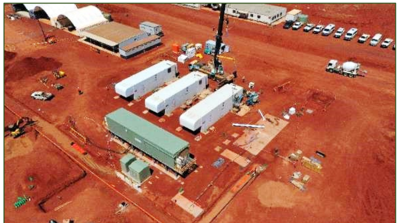
Power station equipment in place at Beyondie SOP Project

“Methodically and deliberately we are working our way through this project’s construction phase, making sure everything is aligned for successful commissioning and commencement of production in the third quarter of the 2021 calendar year,” he said.