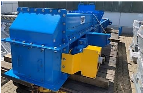
Raw Salt Feeder

Delivery of key equipment for the SOP plant also remains on schedule with two shipments delivered to Fremantle, five ships in transit and four shipments due to depart before the end of October 2020.