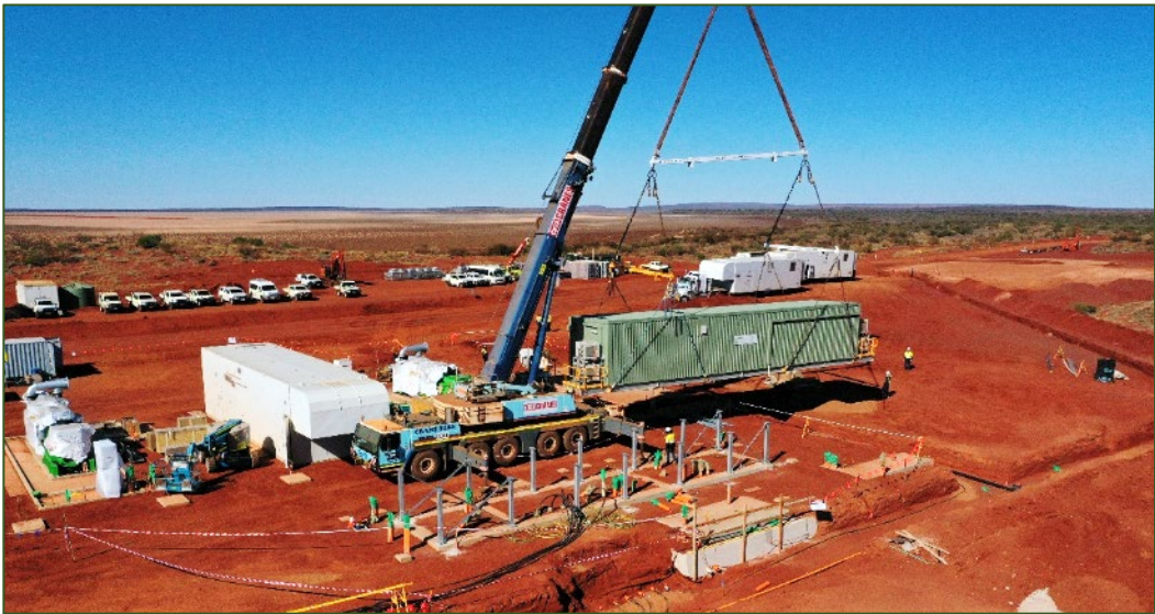
Switch room lifted into position