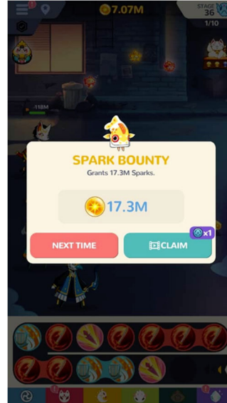
Figure 3 - Gamers can receive virtual-item rewards by watching in-game advertisements