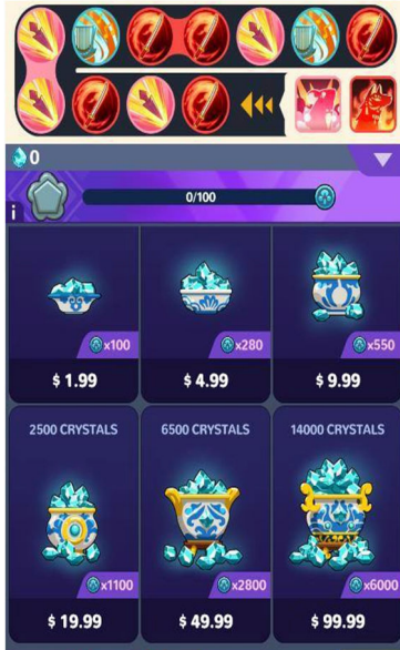
Figure 2 - In-game Purchases. Masketeers allows gamers to purchase power packs to enhance gameplay

iCandy Interactive Limited (ACN 604 871712) Level 4, 91 William Street Melbourne, VIC 3000 Australia