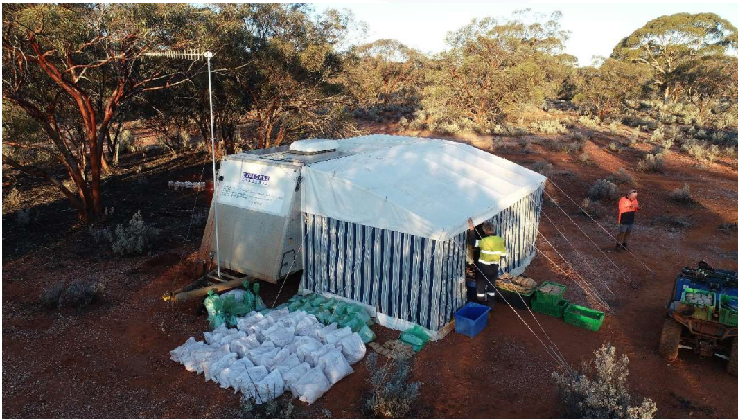
Figure 1: Sampling base camp September 2020 Cutler Area

The Quarterback Geological Team have finalised the interpretation of the recently reprocessed magnetics data. This interpretation has identified over 40 new targets within RGL's tenure (figure 2). Follow up remote Sensing regolith mapping deemed 17 of those magnetic targets amenable to surface sampling.