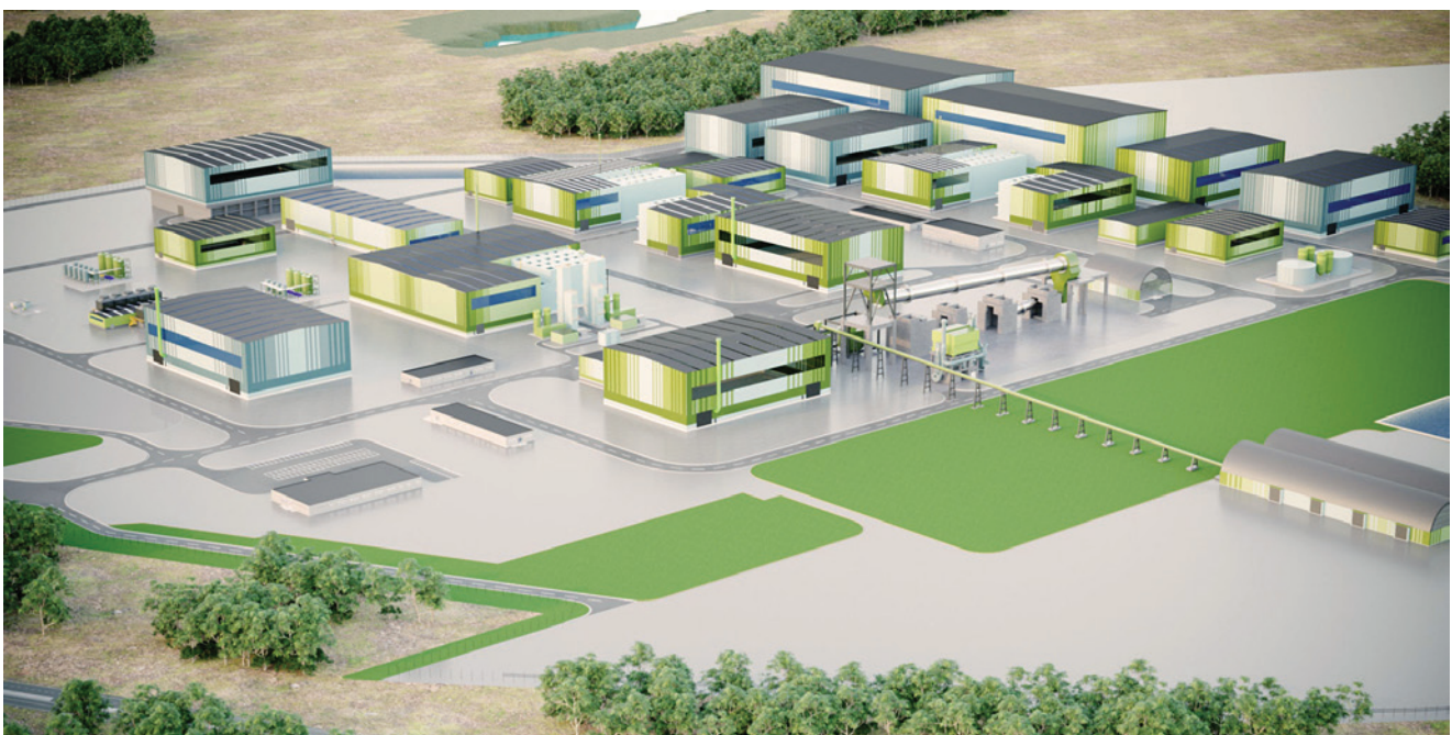
Figure 2: Darwin processing facility 3D model (SMS group)

The scope of work for the FEED Study has been divided into four front-end loading ("FEL") phases – namely, FEL-0, FEL-1, FEL-2 and FEL-3. This covers the process plant equipment required for the mine site Beneficiation Plant and the DPF, including all associated plant and equipment.