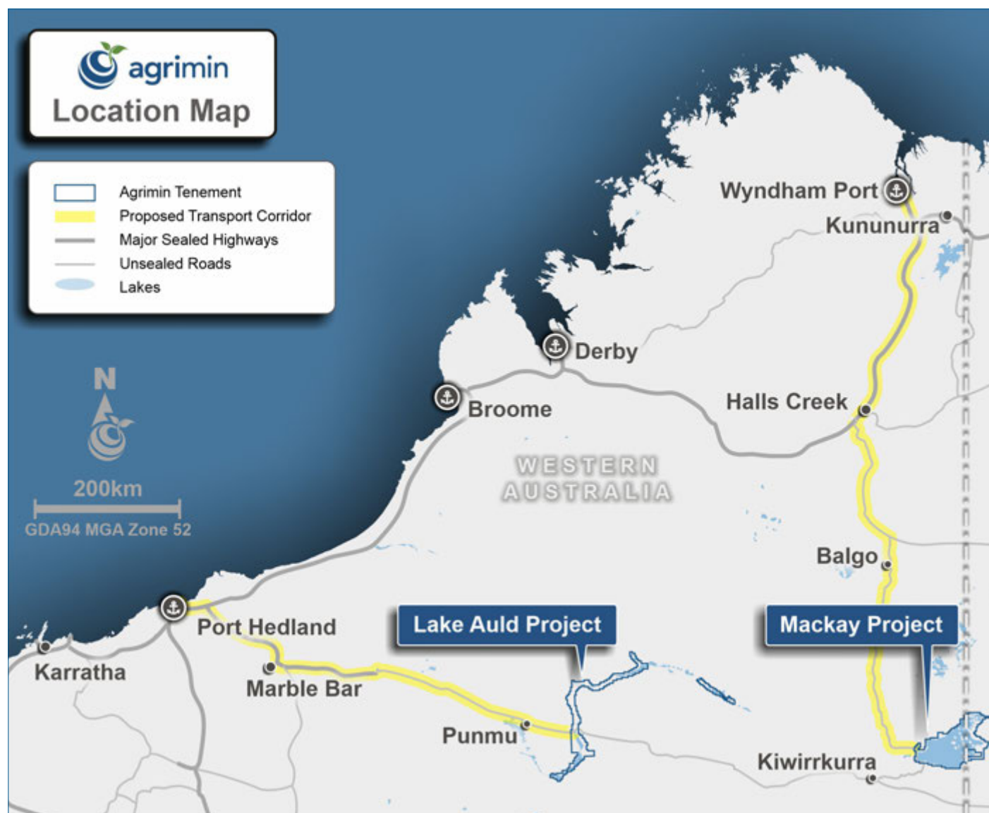
Figure 1: Map of Agrimin's Projects

Agrimin's planned SOP production can play a critical role in improving crop yields for farmers, particularly in the developing countries of South and Southeast Asia. The market for SOP is experiencing strong demand growth, driven in part by rising middle class populations who are consuming increasing amounts of fruit and vegetables.