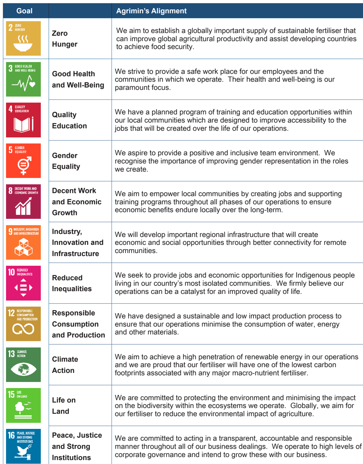
Figure 1. Alignment with the United Nations Sustainable Development Goals

Agrimin is committed to developing the Mackay Potash Project sustainably and in alignment with the United Nations Sustainable Development Goals, as outlined in Figure 1. The Company's commitment is embodied throughout the recently released definitive feasibility study and has been demonstrated through six years of positive stakeholder engagement.