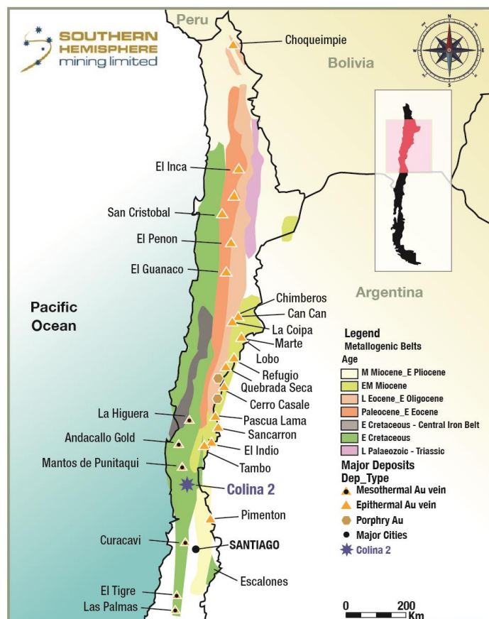
Figure 1: Colina2 Gold Copper Project Location Map showing the locations of significant Gold Deposits in Chile

Southern Hemisphere Mining Limited ("Southern Hemisphere" or the "Company") reports that a 2,800m trenching program at its 100% owned Colina2 Gold Project in Chile has commenced.