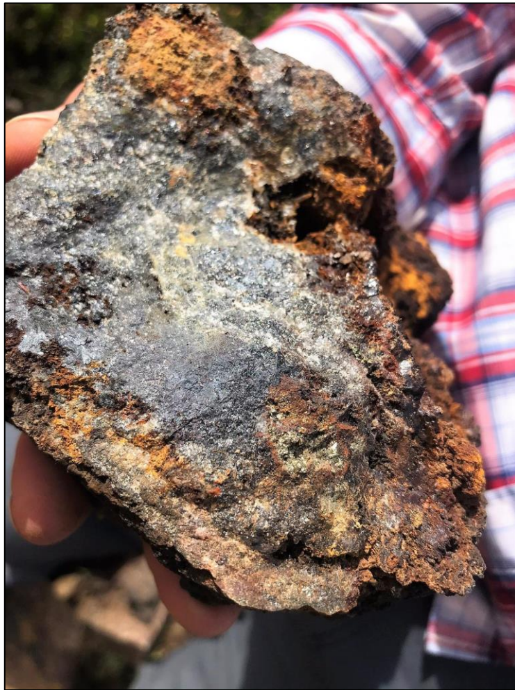
Figure 3 Sample from Trench T10Au at Colina2 with strong limonite/hematite alteration

The drilling program will consist of approx. 2500m of both Diamond and RC to test the width and tenor of the gold mineralisation down dip on 100m spaced sections. Surface mapping shows the structure to dip to the SE coincident with the NE-SW trending fault on the eastern side of the anomaly, which was identified in a re-interpretation of the MMI sampling and the geophysics.