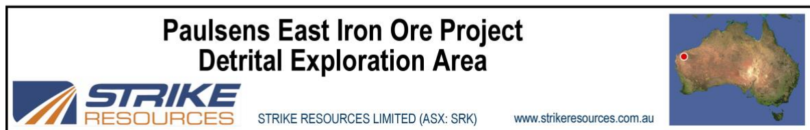
Figure 2 - Location of detrital exploration area

The area being investigated sits partially over the area of the open pit designed for the proposed main Paulsens East Mine - i.e. is surface material that would otherwise have been cleared as waste material as the main Project is developed (refer Figure 2).