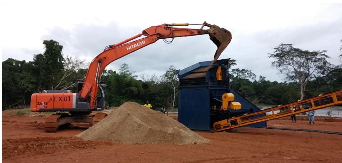
Photograph 3 – Feeding of tailings into the Feed Bin during first phase commissioning of the DMS plant.