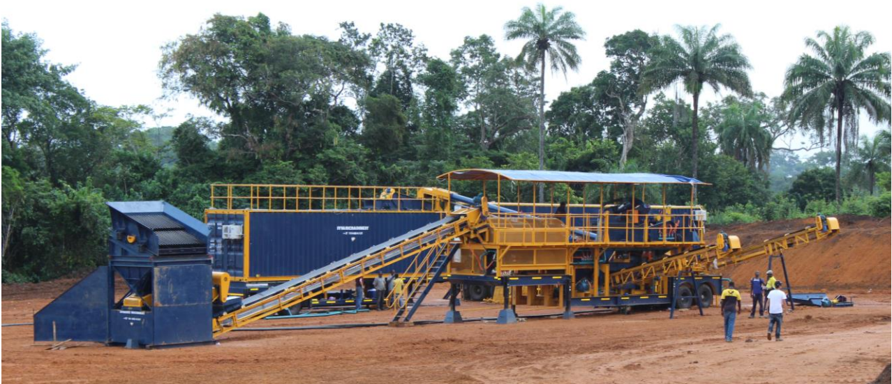
Photograph 1 – Assembly of DMS plant on-site at the Baoma Project, Sierra Leone

A pictorial update of the DMS plant commissioning is presented in Photographs 1 – 3 below.