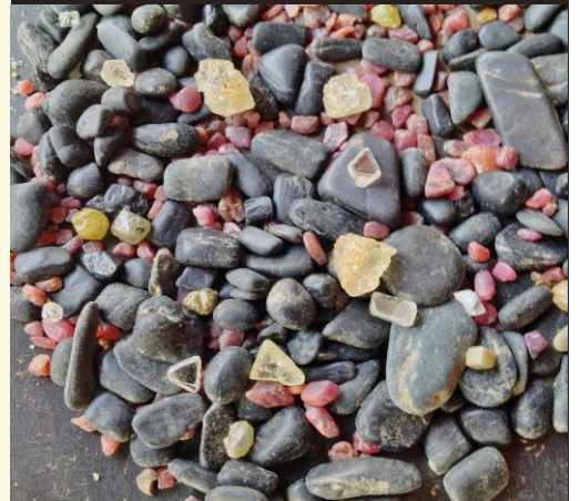
Photograph of diamonds recovered from the processing of bulk samples from Newfield's Allotropes Diamond Project in Sierra Leone.