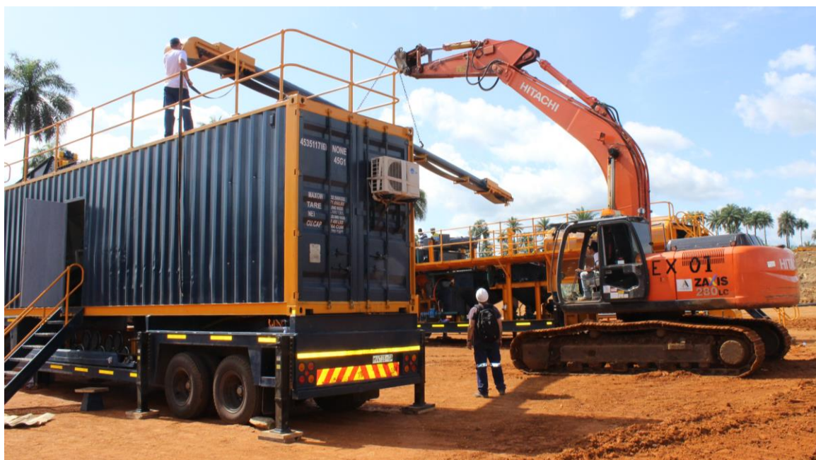
Photograph 2 – Installation of the pipe conveyor system on the DMS plant.