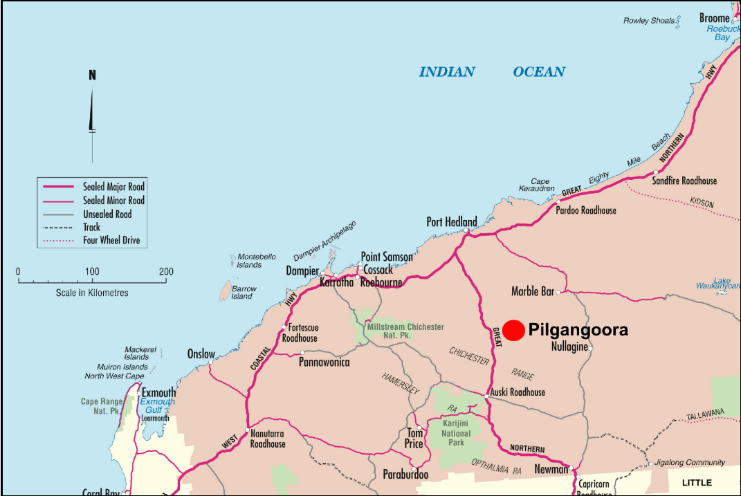
Figure 1 Location of the Pilgangoora lithium project

Pilbara Minerals controls significant resources of lithium within the Pilgangoora project. The lithium ore is hosted 150 km south-east of Port Hedland, in the Pilbara region of Western Australia (Figure 1).