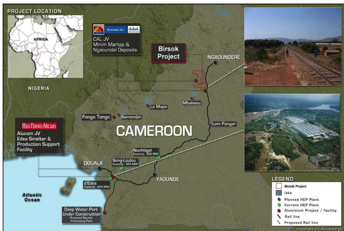
Figure 4 – Location of Canyon’s Birsok Bauxite Project, and the rail line and Douala and Kribi Ports