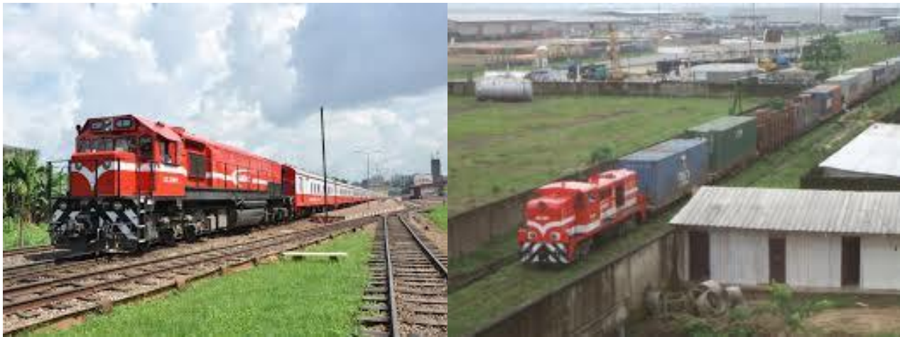
Figures 2 & 3: The Camrail rail operation

The study indicates limited initial capital expenditure will be necessary for dedicated rolling stock and locomotives. The mainline rail system terminates at Bessengue just outside Douala and is linked by a rail system to the port area.