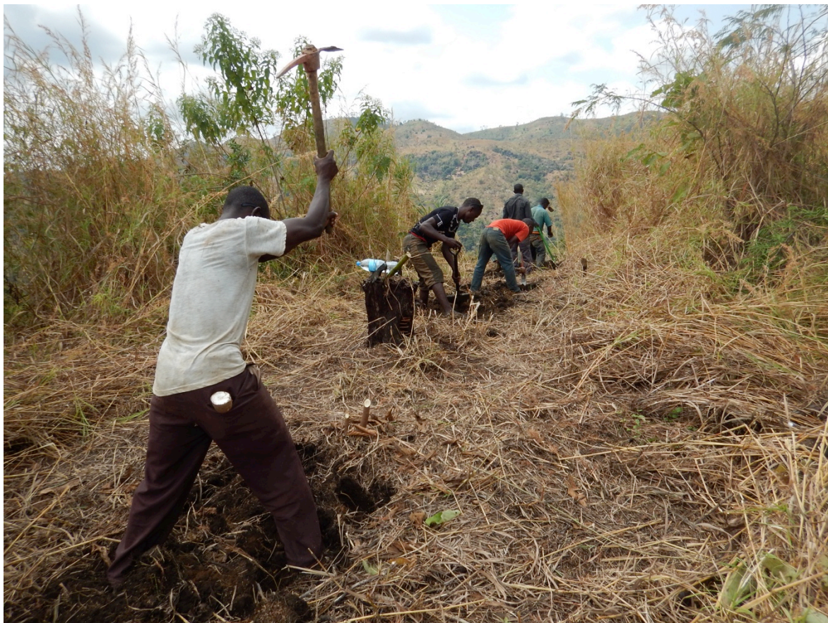
Photo 1. Clearing a trench line

The graphite mineralisation remains open to east where the trench terminated in graphite mineralisation grading 7.49% TGC. The intention is to again extend the trench to determine the extent of graphite mineralisation. The company is pleased with the initial results and confident that additional mapping/trenching in the Cascade area will demonstrate grade and strike continuity, developing into drilling targets.