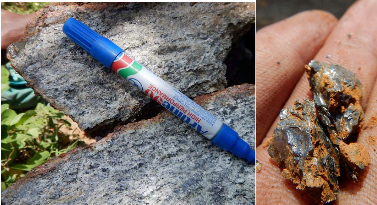
Photos 2,3. Kituti outcrop

To date only one rock chip sample has been reported (12.15% TGC). Additional assays will be reported as they are received from the laboratory. Visual estimates of the graphite mineralisation seen in the mapped Kituti area are encouraging with coarser graphite flake observed than at Epanko North. The company is pleased with the initial indications at Kituti and confident that additional mapping/trenching along the mineralised structure will demonstrate grade and strike continuity, which will develop drilling targets.