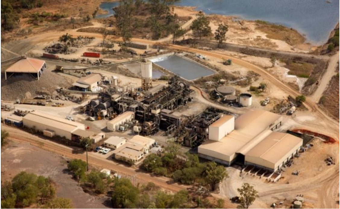
Figure 2: Mt Garnet Processing Plant