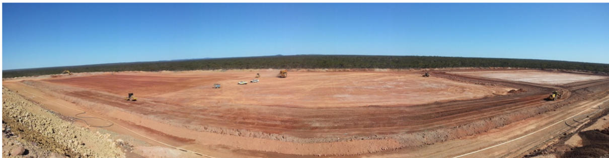
Dewatering - Evaporation Cell Construction

In pit waste dumping is continuing and has contributed to a reduction in trucking requirements and mining costs together with improved environmental outcomes.