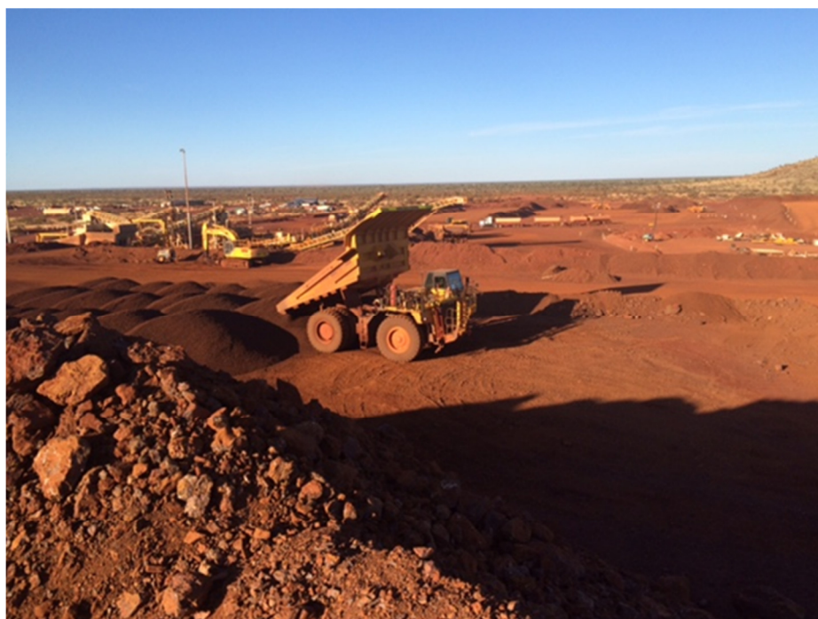
In Full Swing – Ore Stockpile and Infrastructure at Iron Valley

Initial beneficiation test work has commenced. If successful, the lower grade fines from the project could be used as plant feed at some stage in the future.