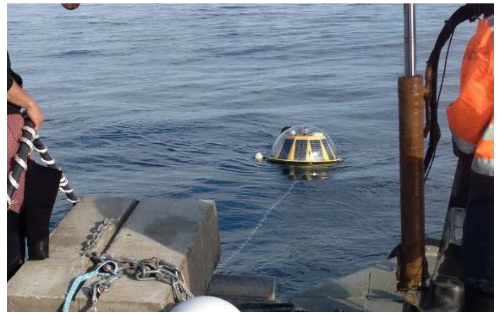
Wave measurement buoy being deployed in the CETO 6 project area

Following on from Carnegie's Perth Wave Energy Project, the CETO 6 offshore project site will be located approximately 8 km further offshore from the current Perth Project site, with the exact location to be determined following geophysical surveys. The offshore site, located off Five Fathom Bank, provides deeper water than the original Perth Project site and will be the first demonstration of Carnegie's next iteration of its CETO technology, CETO 6. The wave resource at the CETO 6 project site is expected to be some three times more energetic than the existing Perth Project site.