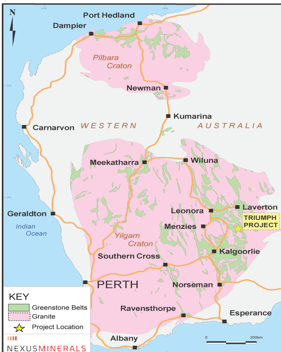
Figure 1. Triumph Project location, Western Australia.

Nexus Minerals Limited (ASX: NXM) (“Nexus” or “the Company”) is pleased to announce that drilling has commenced at the Triumph Gold Project, 145km northeast of Kalgoorlie, WA (Fig 1).