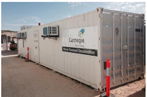
Interior and exterior of containerised desalination plant