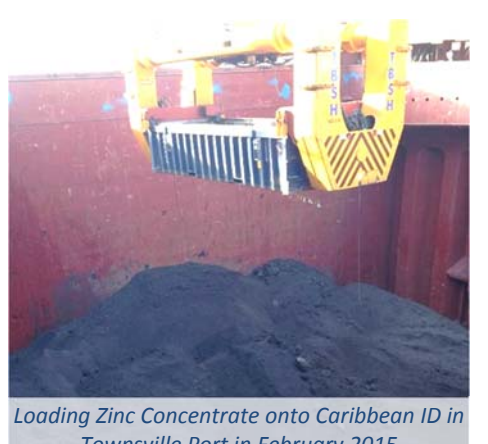
Townsville Port in February 2015

The Mt Garnet concentrator continued operating seamlessly post transfer from SPM to CSD. The concentrator continues operating 24/7 producing approximately 2,500 tonnes of zinc metal in concentrate, 700 tonnes of lead metal in concentrate and 180 tonnes of copper metal in concentrate per month. The Mt Garnet concentrator currently has 39 staff and is located adjacent to the town of Mt Garnet which has all the modern facilities and infrastructure expected in a small town. Many of the staff reside locally and the company leases a number of houses in the town for staff accommodation.