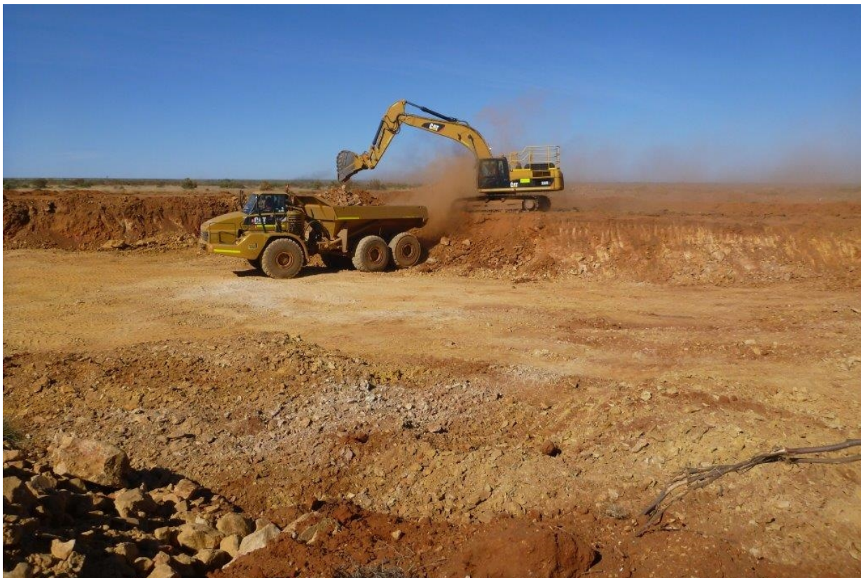
Figure 1. Mining at Old Pirate underway