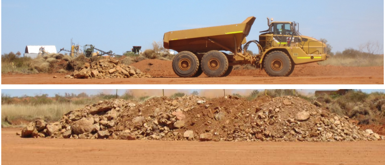
Figure 4. First ore on to the ROM pad

Resource Mining Pty Ltd (our mining contractor) has mobilised to site and site-works are well advanced. The waste rock and initial mining footprint areas have been cleared and the pre-strip mining of waste has commenced. Some surface ore has been moved and stockpiled on the newly formed ROM pad area with mining of ore expected to commence in earnest within 3 weeks.