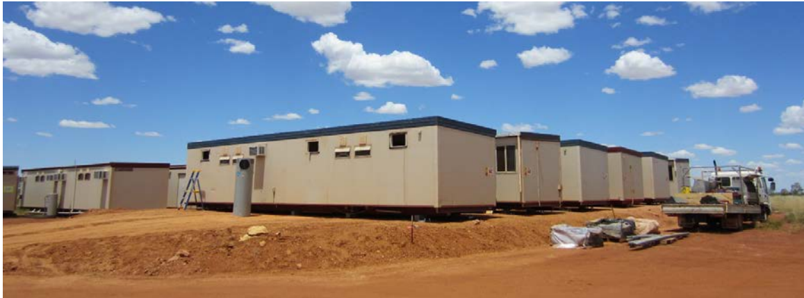
Figure 6. New accommodation arrived and installed on site

The commissioning of the Coyote Gold Plant and first ore processing is expected during May 2015.