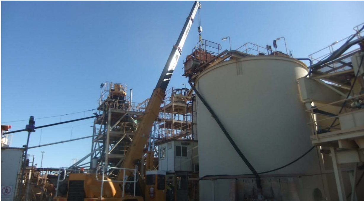
Figure 2. Removing screen above leach-tanks for cleaning and maintenance

ABM Resources is accessing the Coyote Gold Plant under agreement with Tanami Gold NL (refer announcement 07/07/2014). Como Engineering is on-site and has commenced the refurbishment work on the Coyote Plant. Refurbishment work involves cleaning of screens, upgrading of conveyor belts, work on the leach tanks as well as general maintenance. This work is going to plan and on schedule.