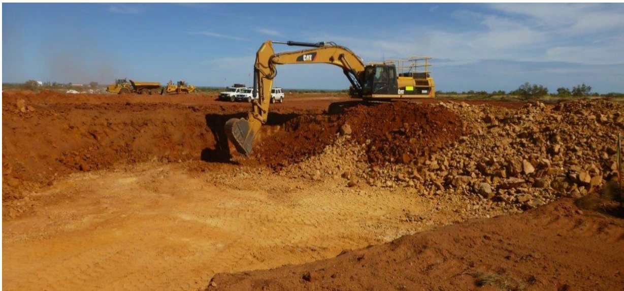
Figure 3. Mining / pre-strip at Old Pirate