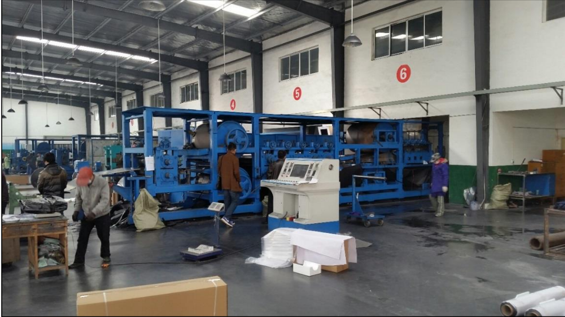
Figure 2. Graphite paper presses in the YXGC factory.