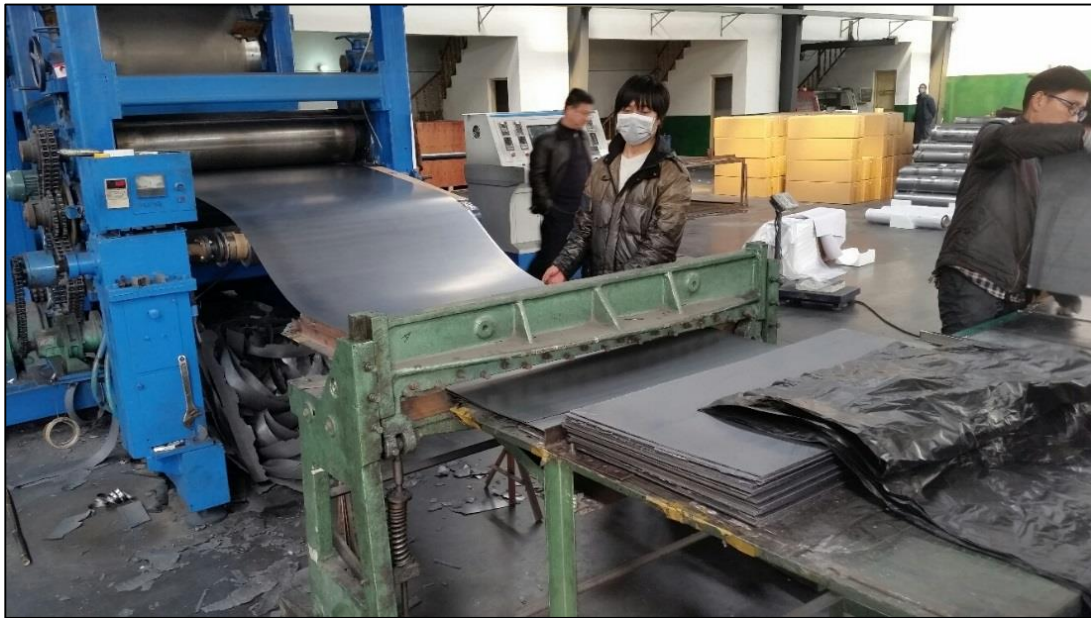
Figure 3. Graphite paper sheets made from expanded graphite in the YXGC factory