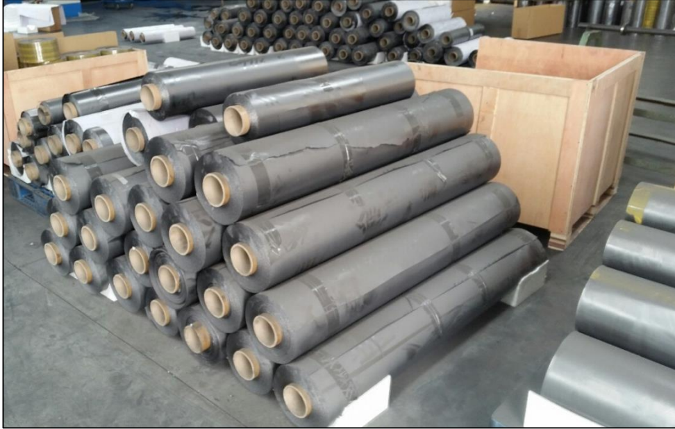
Figure 4. Examples of 1.5m wide graphite paper rolls in the YXGC factory