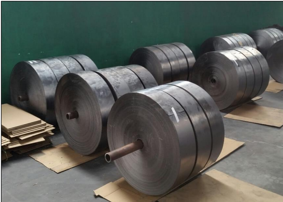
Figure 5. Examples of 1km roll of graphite paper in the YXGC factory