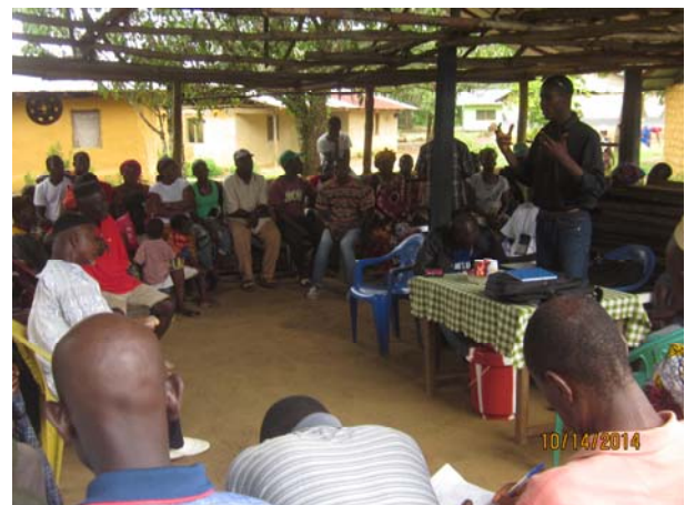
Figures 2 and 3 | Project briefing with the Garwular District Commissioner (left) and Daniels Town Community Consultation (right)