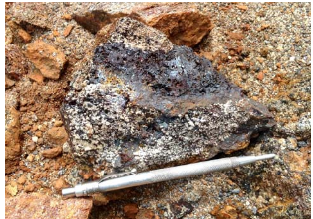
Figure 7 | Friable itabirite mineralisation in drill pad cuttings (left) and hand specimen (right) at Zaway NW

Field staff commenced low-cost mapping and rock-chip sampling using the hand-held XRF analyser within the southern license MEL1223/14 to define additional high-priority exploration targets.