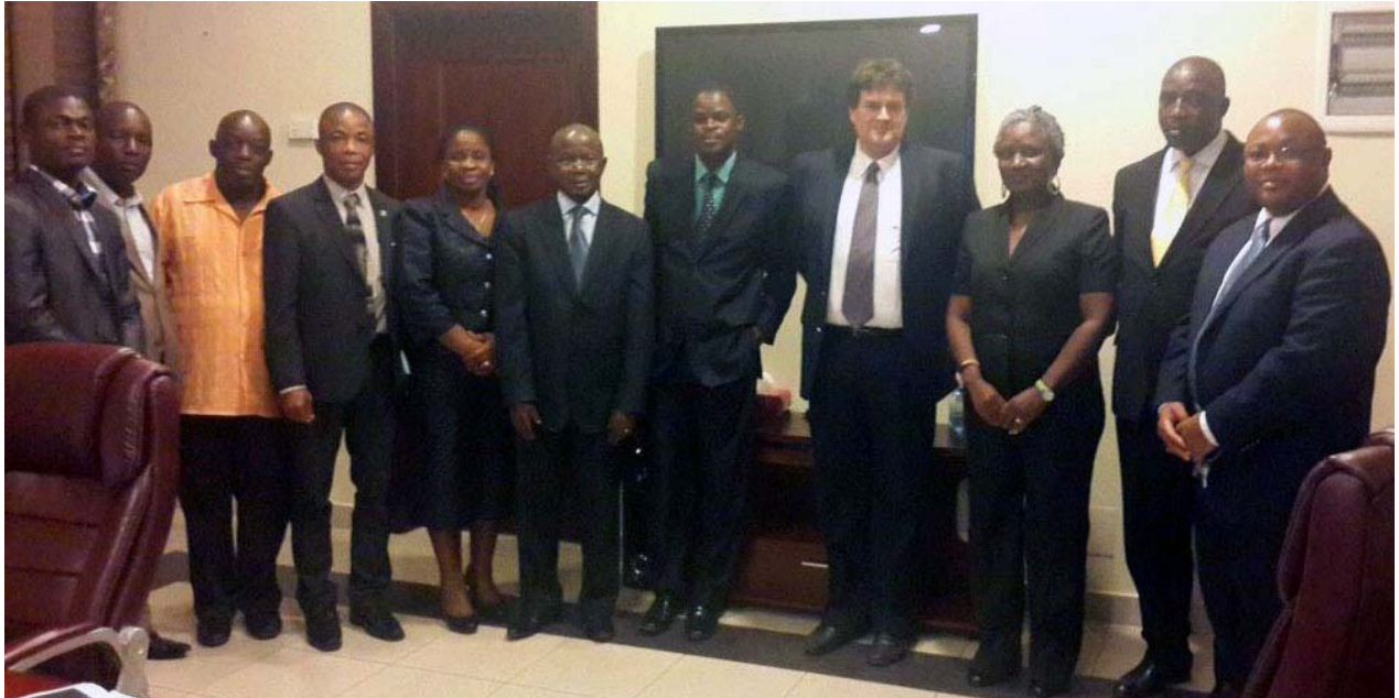
Figure 1 | Key Liberian government representatives and Tawana representatives present at Tawana's recent formal IMCC presentation

The IMCC presentation and corresponding negotiations regarding the technical, commercial, financial and socio-economic and labour aspects of the MDA, represent a critical step forward in the advancement and conclusion of Tawana's MDA.