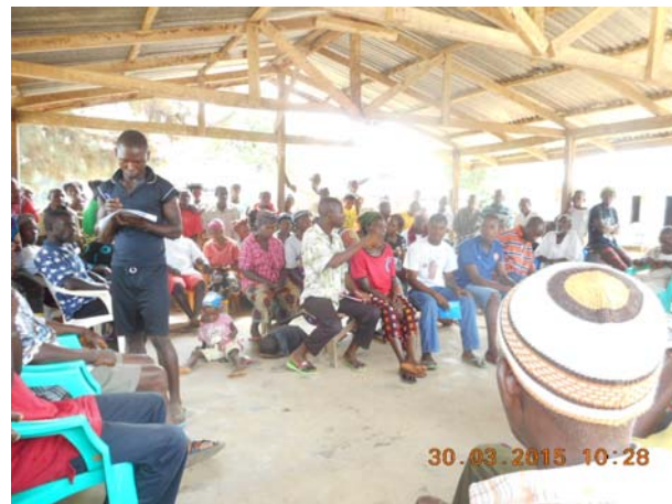
Figures 4 and 5 | Community consultations with Gabaeja Town elders and community members (left) and Zaway Town community consultations and Project Briefings (right)