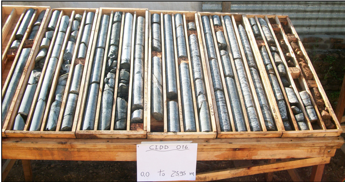
Figure 3: Drill hole from Cerro Iman displayed and remarked ready to describe.

In order to fulfil the local government requirements to maintain the mining licenses, the Company had to revise and cover a total of 27 permits. Most cases required full surface mapping to ensure compliance with the licenses conditions. Detail surface mapping covered a total of 315 hectares and regional mapping covered almost 8,700 hectares.