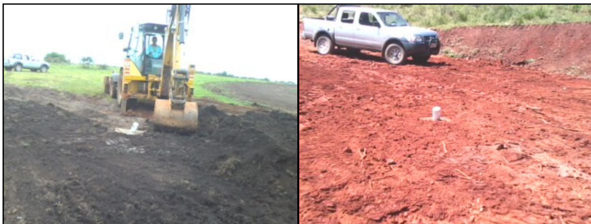
Figure 5: Drill hole platform remediation in Cerro Papagayo and Cerro Iman.

Environmental remediation activities were also carried out upon the request of the DINAMA (Uruguayan Government Environmental Agency). A total of 15 old drill platforms amended together with road paths. Earth works were undertaken and grass seeds combined with soil were dispersed over the paths. Water channels were cleaned to avoid flooding of crop land and further control surface runoff as well as soil erosion in places.