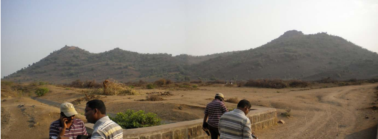
Project Topography at AP14 showing distinctive hillock feature