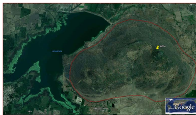
AP14 Location showing nearby water resource