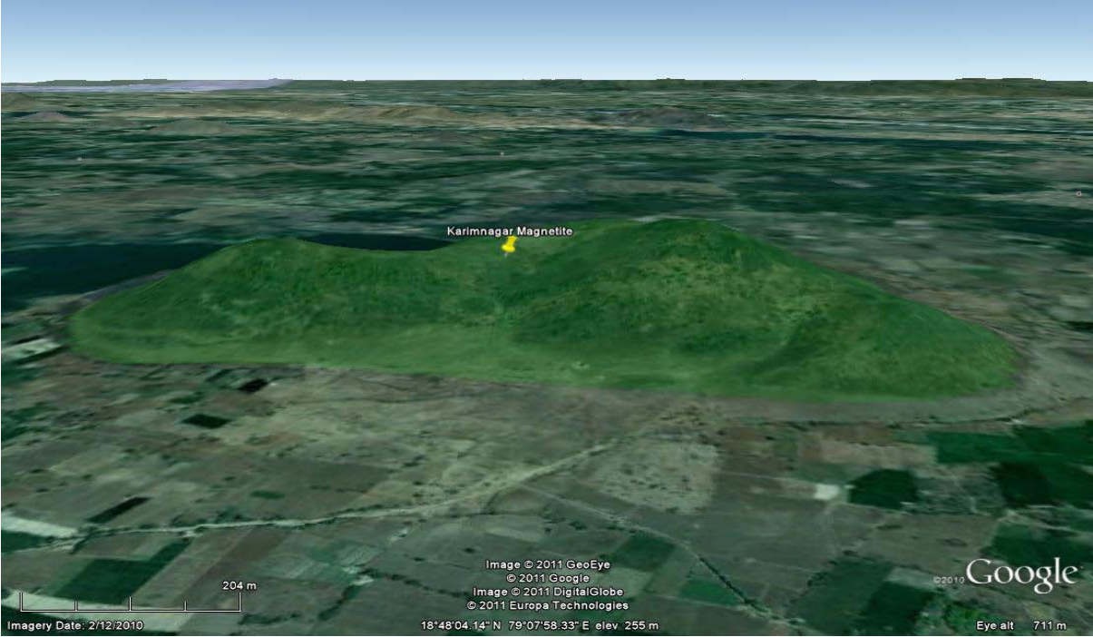
Project Topography at AP14 showing distinctive hillock feature

For full project details please refer to ASX announcement dated, 1 st February 2013.