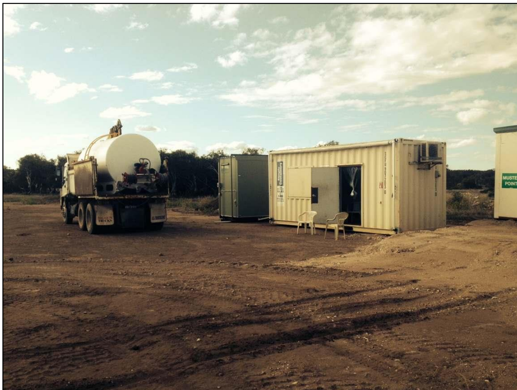
Dunnart-2 Site Offices, Crib Room and Water Tanks