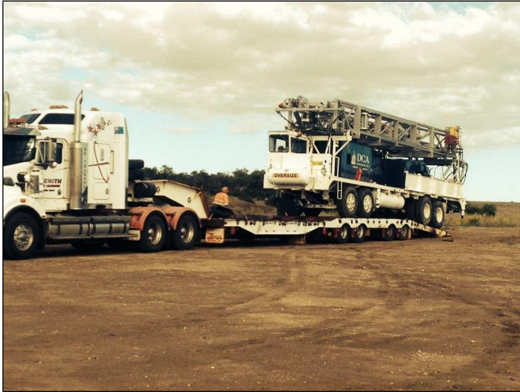
DCA Rig 6 being unloaded at Dunnart-2