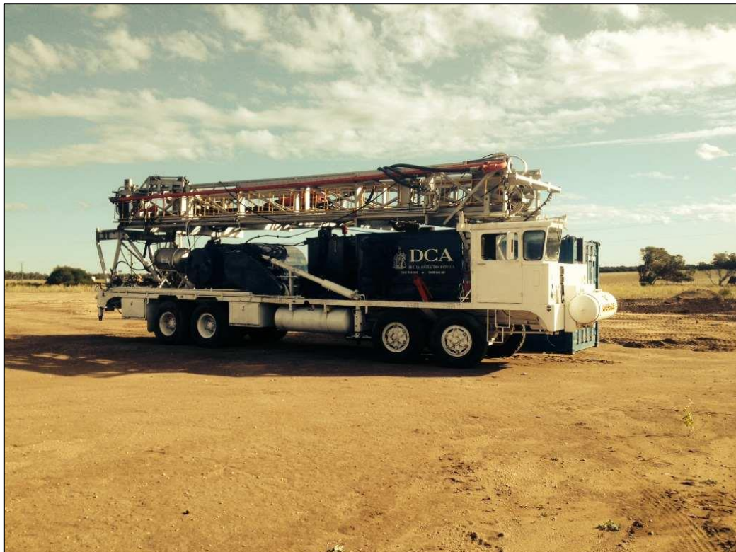
DCA Rig 6