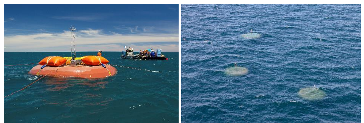
CETO 5 Unit 1 being installed in November, 2014 (L), CETO 5 three unit array operating (R)

Carnegie will receive milestone payments from ARENA of $1.5m for the manufacture, completion and deployment of the three CETO 5 units as well as the successful commissioning of the Perth Project. The commissioning milestone was awarded as all operational components of the Project are installed and operational and practical completion was reached on all Project construction activities. The Perth Project is the only grid connected wave energy project currently operating anywhere in the world. The three CETO Units have cumulatively operated for more than 9,500 hours.